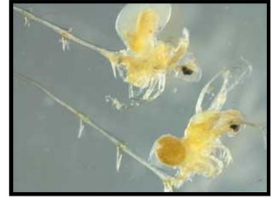
Spiny Water Fleas

Remember when leaving a boat launch to check all gear and to remove any foreign materials (mud, animals, & plants), clean all gear, drain wells & buckets, and dry equipment before launching into another body of water.