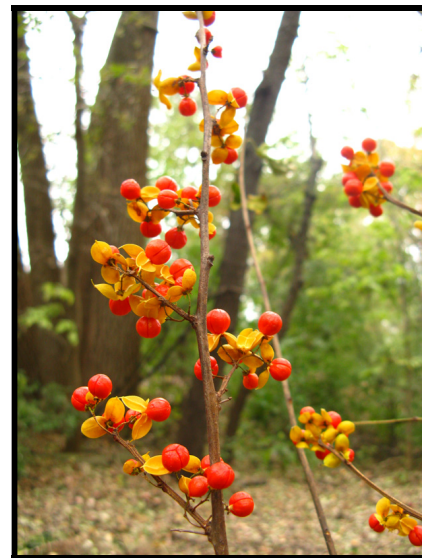
Asiatic bittersweet berries

Asiatic bittersweet is listed as a restricted species under Wisconsin's Invasive Species Rule, Chapter NR 40. Restricted species are those that are already present throughout the state of Wisconsin and are not likely to be eradicated even though they are likely to cause significant environmental and economic harm or harm to human health. The NR 40 Rule makes it illegal to transport, transfer, or introduce invasive species listed as restricted in Wisconsin. If you suspect you have Asiatic bittersweet on your property, contact DCIST for identification or for more information on what you can do to halt invasion of exotic plants on your land. Remember if you find invasive species in Door County, be sure to report it to DCIST or use the GLEDN app!