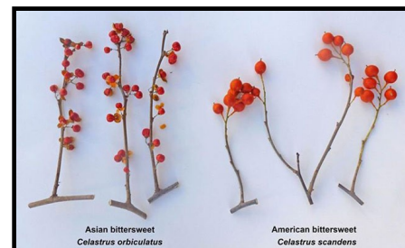
Asiatic bittersweet vs American bittersweet