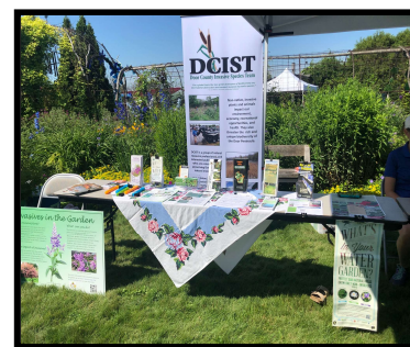
DCIST information table at the Garden Door Open House