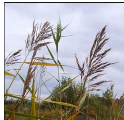
Phragmites seed heads.