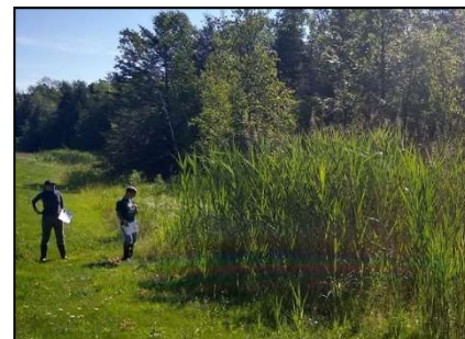
SWCD LTEs surveying phragmites stand

Common reed ( Phragmites australis ) is a restricted species under Wisconsin's Invasive Species Rule Chapter NR 40. Restricted species are those that are already present throughout the state of Wisconsin and are not likely to be eradicated and are likely to cause significant environmental and economic harm or harm to human health. The NR 40 Rule makes it illegal to transport, transfer, or introduce invasive species listed as restricted in Wisconsin. If you find Phragmites in Door County, be sure to report it to DCIST or using the GLEDN app!