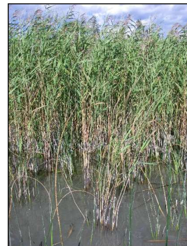
Phragmites stand growing in standing water.