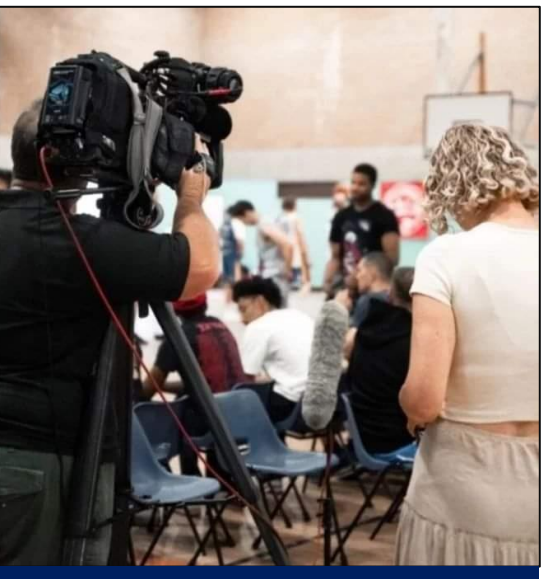
The BBC attended WCBT2022 and provided global exposure for the event and our sponsors.

All BBL /NBL coaches are invited to attend to watch the high calibre player taking part in the WCBT weekend, in addition to spectators, who rarely get to see this level of competition in the UK.