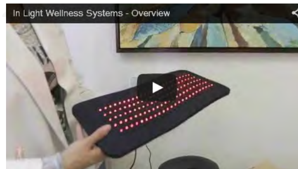
In Light Wellness Systems: Overview Viewable at: tinyurl.com/ilwsoverview