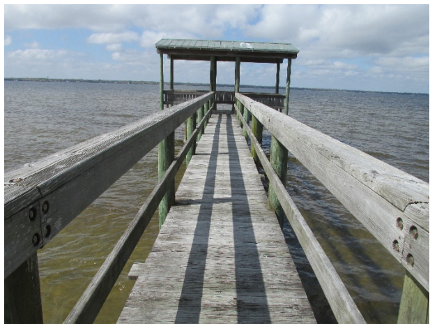
Wood pier gazebo