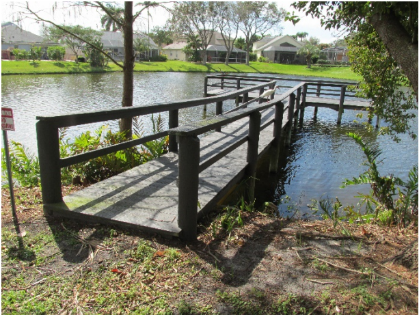
Wood dock overview

Condition: Fair overall with wood deterioration evident