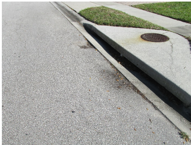
Catch basin with settlement evident on Sunset Lakes Drive

Useful Life: The useful life of catch basins is up to 65 years. However, achieving this useful life usually requires interim capital repairs or partial replacements every 15- to 20-years.