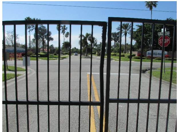
Gates with damage evident