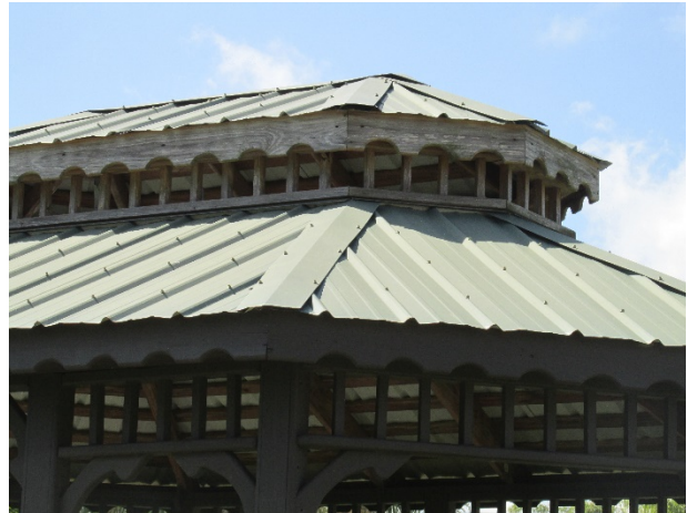
Gazebo metal roof

Useful Life: Up to 25 years with periodic maintenance