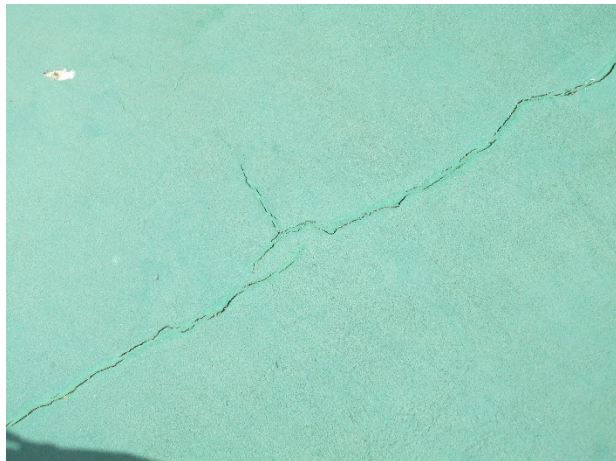
Basketball court cracks evident