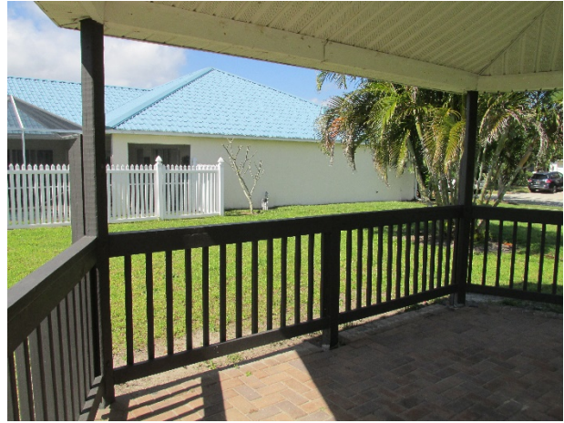
Gazebo paver deck, railings and soffit