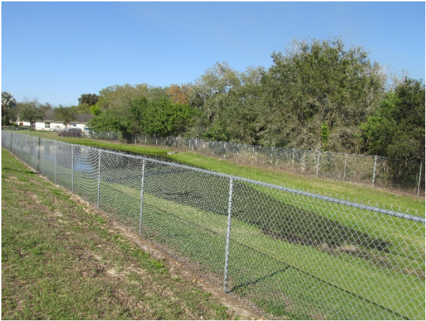
Chain link fence

Condition: Fair overall with vegetation cover evident