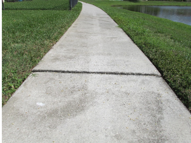
Concrete sidewalk with trip hazard evident