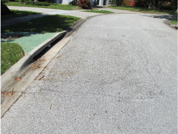
Asphalt pavement on Sierra Drive – Note slippage cracks at catch basin evident