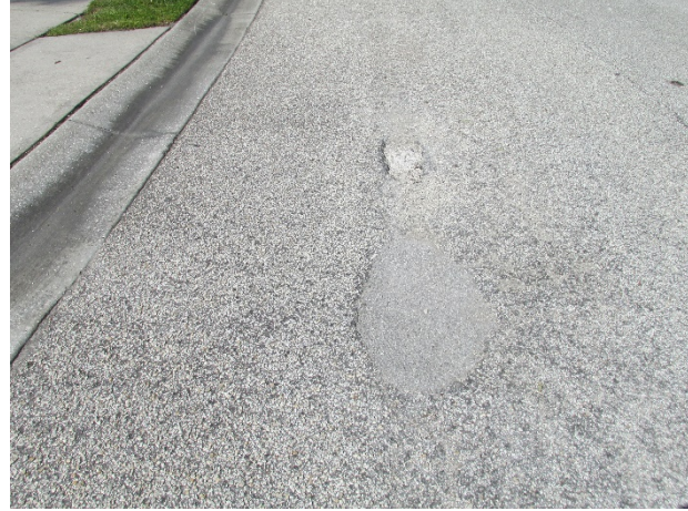
Asphalt pavement on Sunbeam Court – Note raveling and deterioration evident