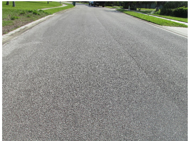
Asphalt pavement on Tradewinds Trail