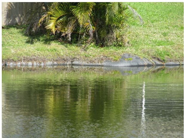
Pond shorelines with geotubes exposed