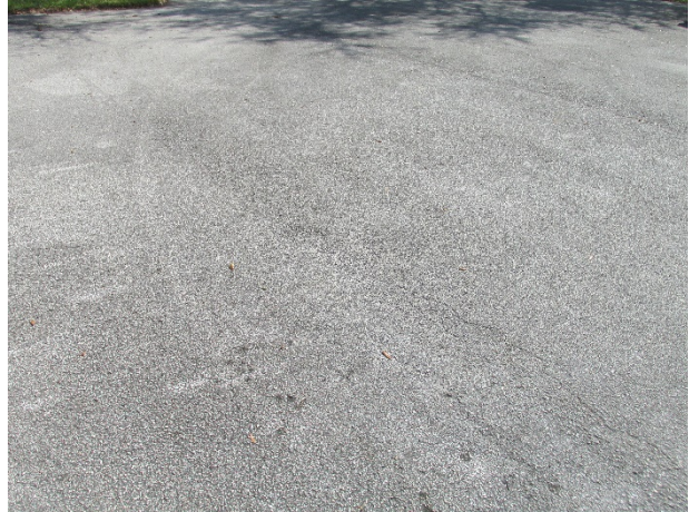
Asphalt pavement at amenity parking area