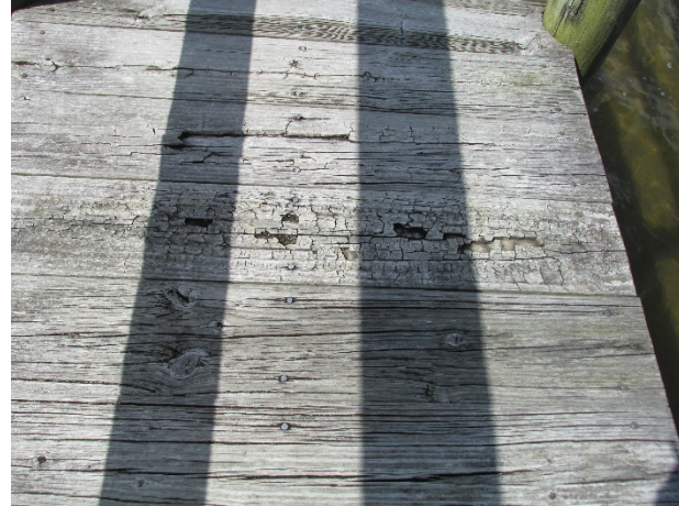
Wood deterioration evident