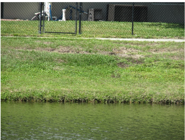
Pond shorelines with isolated erosion