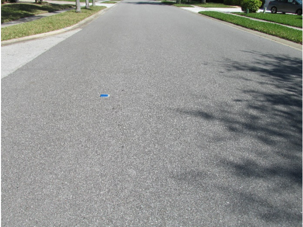
Asphalt pavement repaved in 2019 on Sunset Lakes Drive