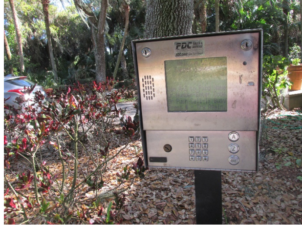
Intercom panel at main gate