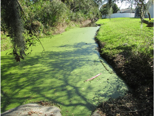
Canal at east perimeter of property