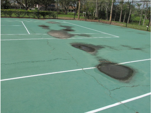
Tennis court surface settlement evident