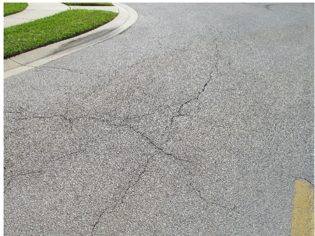
Asphalt pavement on Windchime Place – Note surface cracks evident