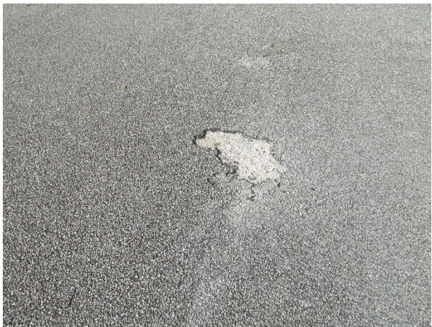
Asphalt pavement on Tradewinds Trail – Note deterioration evident