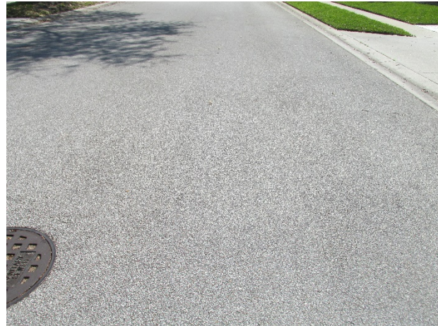
Asphalt pavement on Limerick Drive

Useful Life: 15- to 20-years with the benefit of timely crack repairs and patching