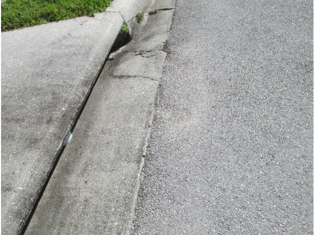
Catch basin with settlement evident on Sunflower Court