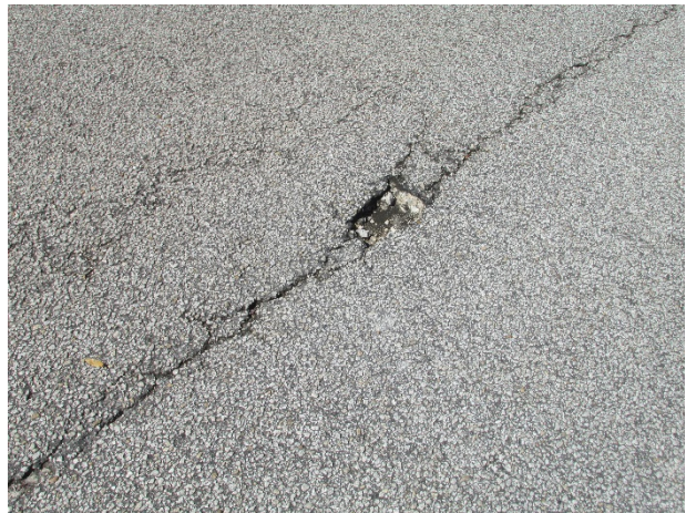
Asphalt pavement on Sunward Drive – Note centerline cracks with pothole evident