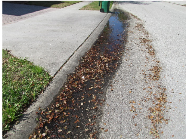
Concrete gutters with ponding water evident on Tipperary Drive