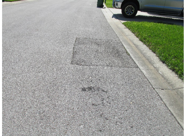
Asphalt pavement on Sierra Drive – Note settlement at patch evident