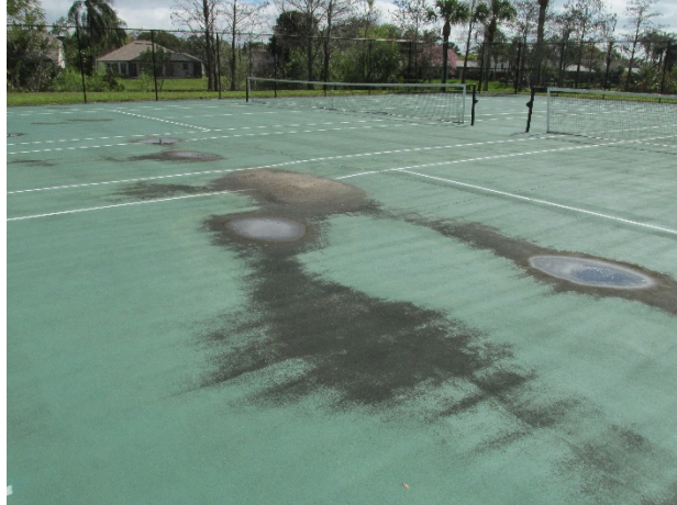
Tennis court surface settlement evident