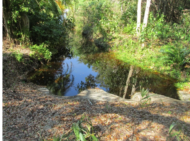
Canal at east perimeter of property

Useful Life: Shorelines are subject to fluctuations in water levels, increased plant growth and migrating storm and ground water resulting in the need for erosion control measures up to every 5- to 10-years.