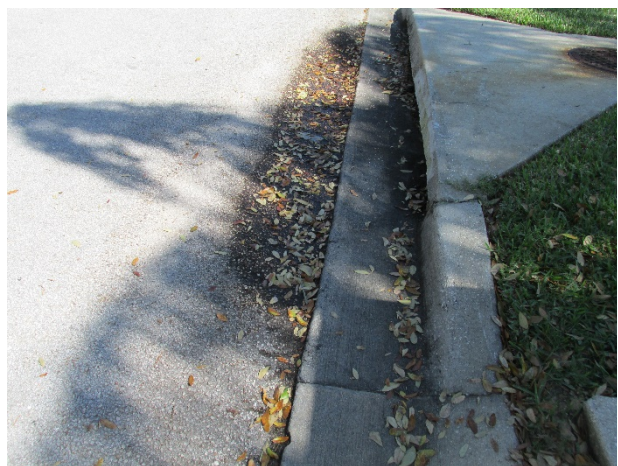
Catch basin with settlement evident on Sunward Drive

Condition: Fair overall with widespread settlement visually apparent