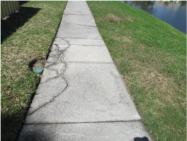
Concrete sidewalks with cracks and settlement evident

Condition: Good to fair overall with settlement (causing horizontal sloping conditions), trip hazards and cracks evident