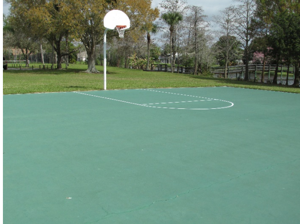
Basketball court overview