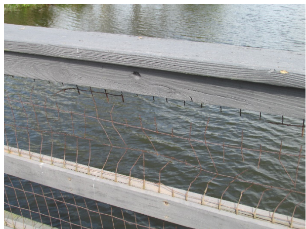
Bridge with rust and deterioration evident at railing wire mesh