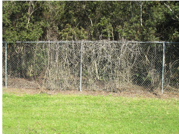
Chain link fence with vegetation cover