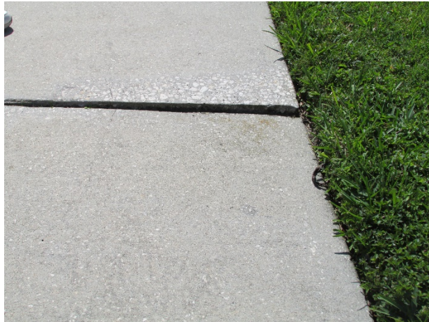
Concrete sidewalk with trip hazard evident