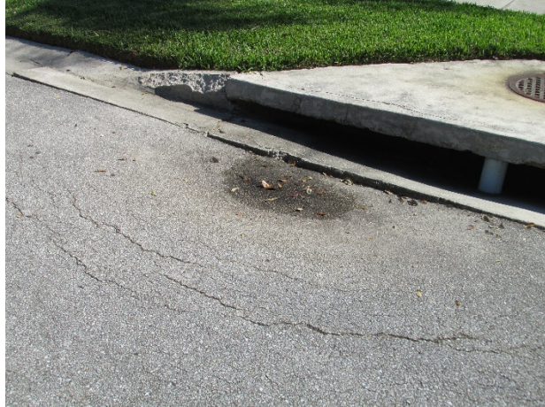
Catch basin with settlement evident on Killarney Court