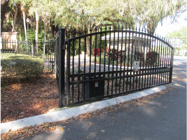
Gate and operator at main gate

Condition: The gates are in satisfactory condition overall with some finish deterioration and damage evident. The gate operators are reported in unsatisfactory condition with a history of ongoing repairs.