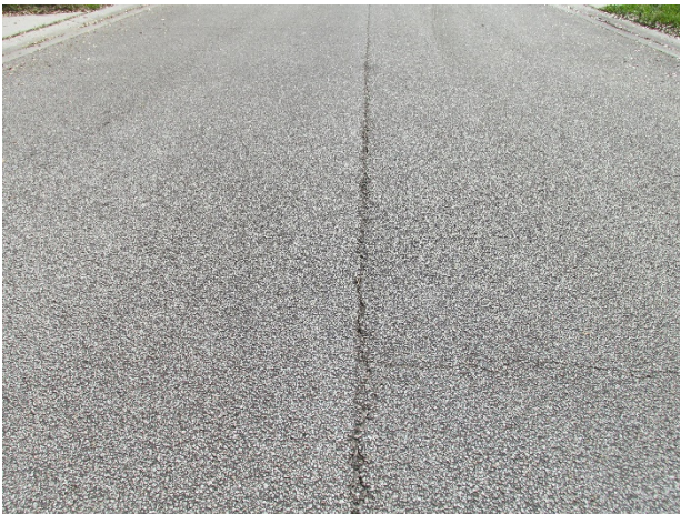
Asphalt pavement on Sunward Drive – Note centerline cracks evident