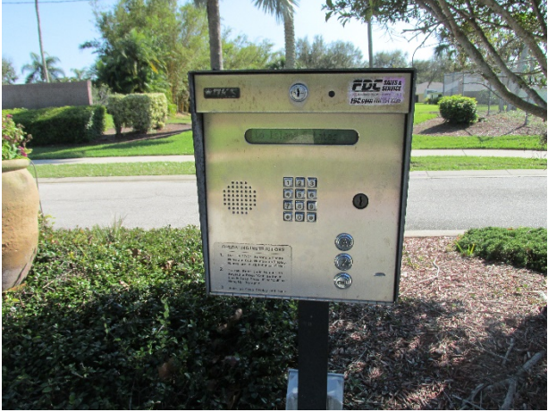
Intercom panel at Island Estates gate

Condition: Reported unsatisfactory overall