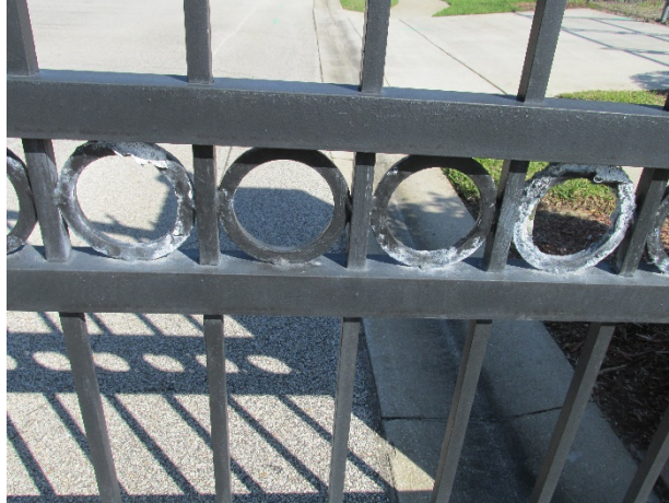
Gate with finish deterioration evident

Useful Life: Up to 10 years for the operators and up to 20 years for the gates