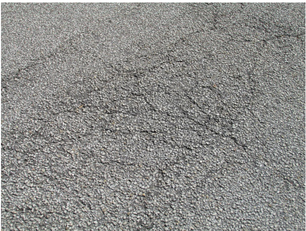
Asphalt pavement on Sunward Drive – Note surface cracks evident