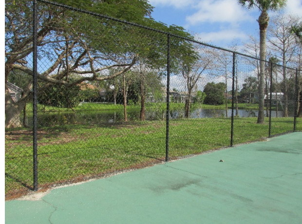
Tennis court fence