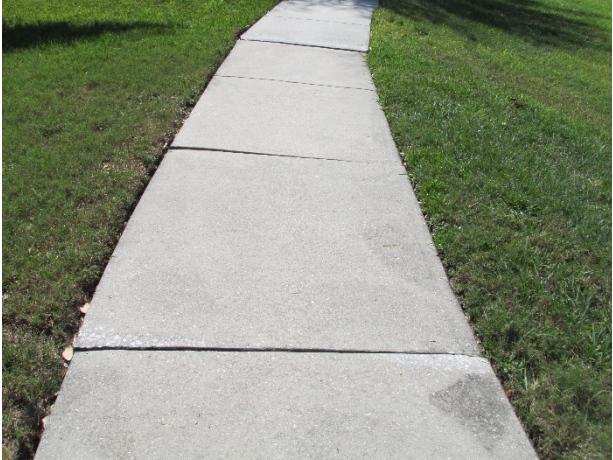
Concrete sidewalks with settlement evident