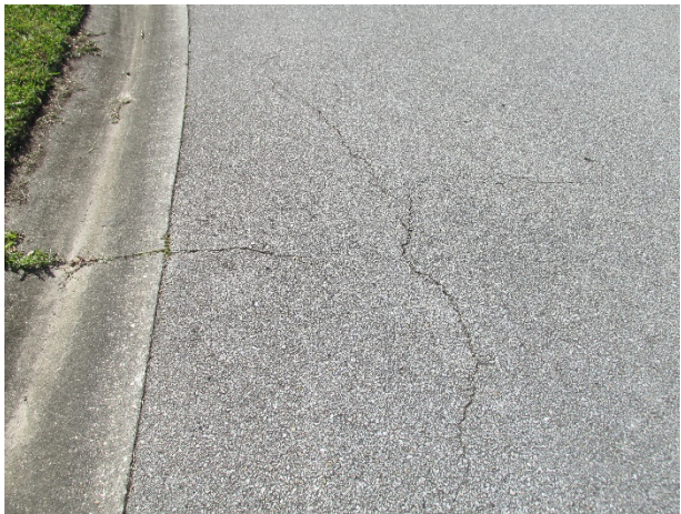
Asphalt pavement on Killarney Court – Note surface cracks evident