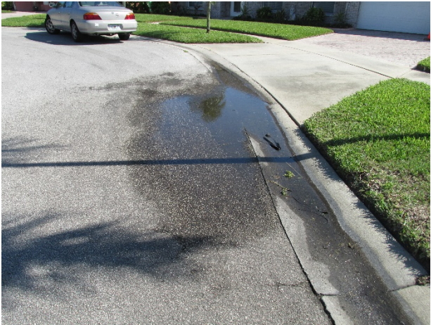
Concrete gutters with ponding water evident on Killarney Court

Condition: Good to fair overall with cracks and areas of settlement causing ponding water at driveways