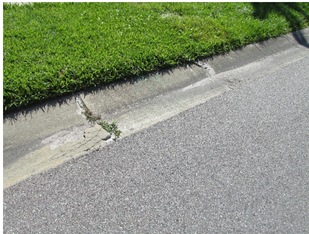
Concrete gutters with cracks evident

Useful Life: Up to 65 years although interim deterioration of areas is common