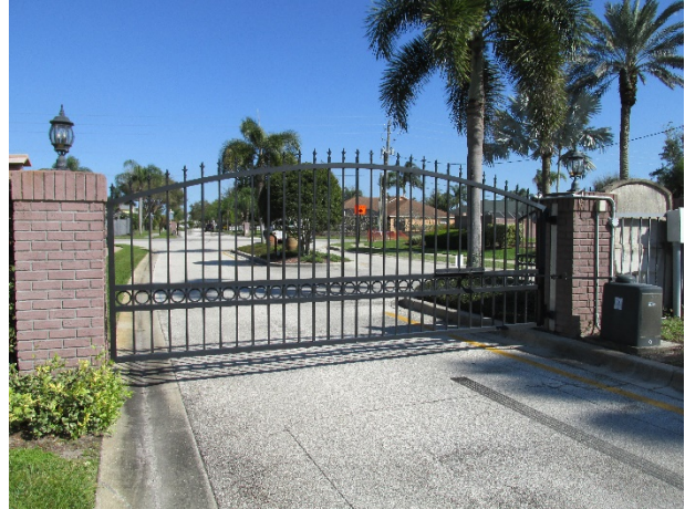
Gate and operator at Island Estates