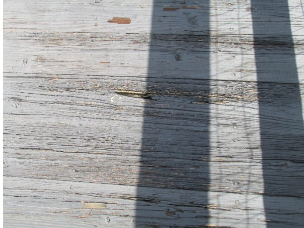
Bridge with wood deterioration evident