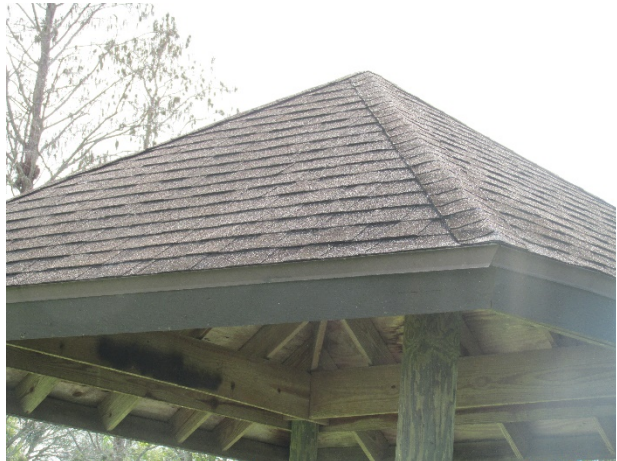
Asphalt shingle roof at pavilion

Useful Life: Renovation up to every 25 years