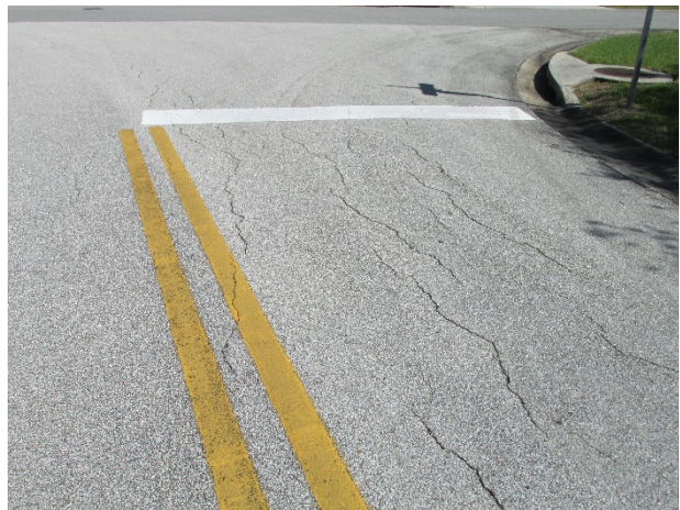
Asphalt pavement on Sierra Drive – Note longitudinal cracks evident