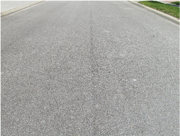
Asphalt pavement on Tipperary Drive