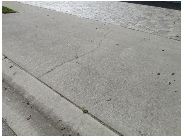
Concrete apron with minor cracks

Useful Life: Up to 65 years although interim deterioration of areas is common