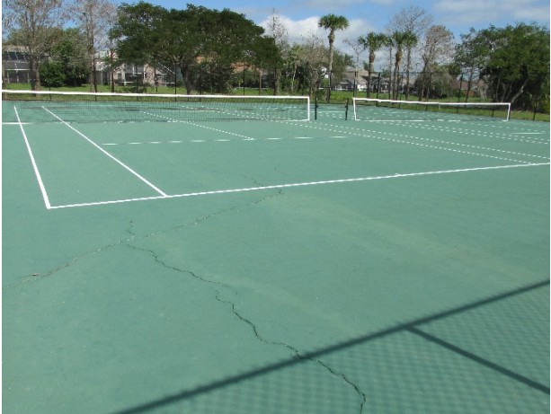
Tennis courts overview

Condition: The tennis court is in poor overall condition and the basketball court is in good to fair overall condition.