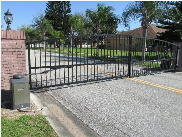
Gates and operators at rear gate