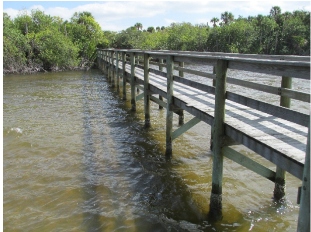
Wood pier overview