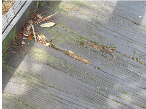
Bridge with wood deterioration evident