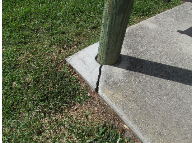
Cracks at bases of posts evident