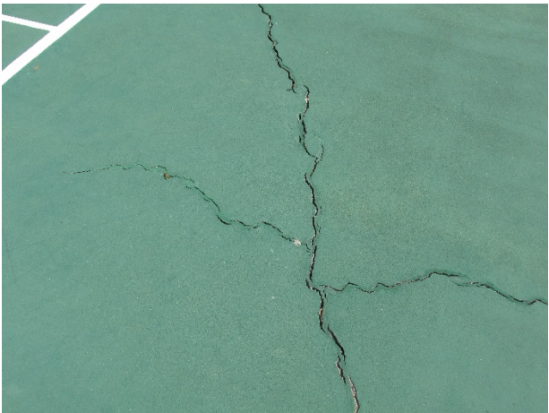
Tennis court cracks evident