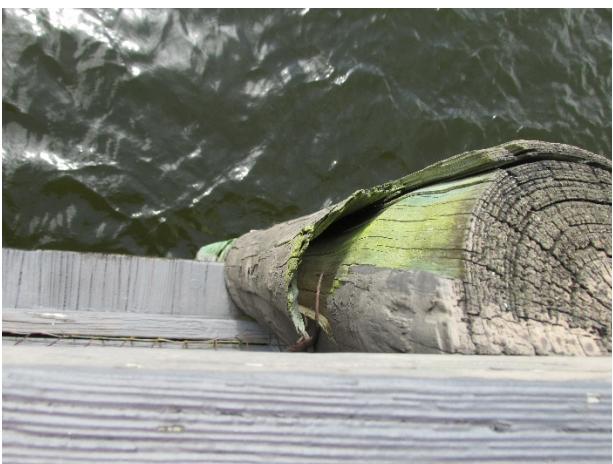
Bridge with wood deterioration at piling evident