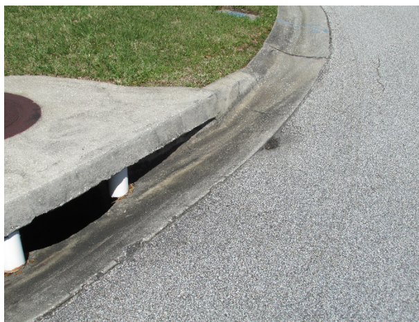
Catch basin with settlement evident on Sierra Drive