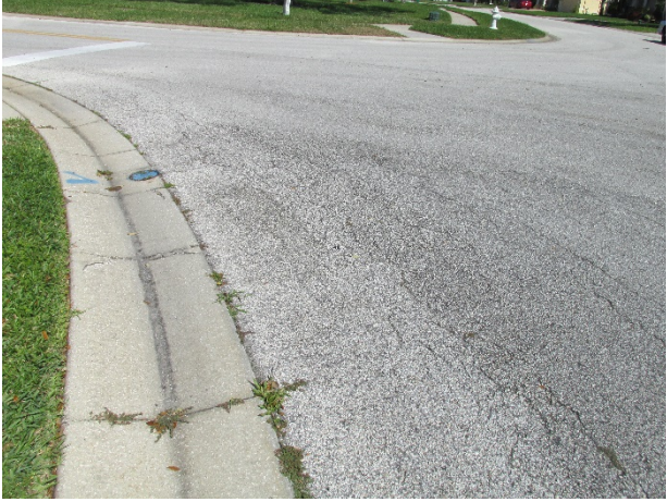
Asphalt pavement on Sierra Drive – Note longitudinal cracks evident