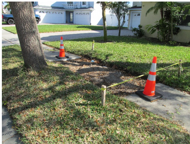
Concrete sidewalks with replacements underway

Useful Life: Up to 65 years although interim deterioration of areas is common