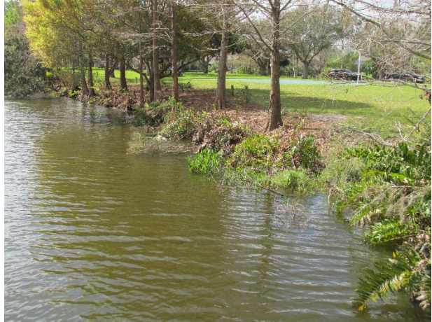
Pond shorelines with plantings