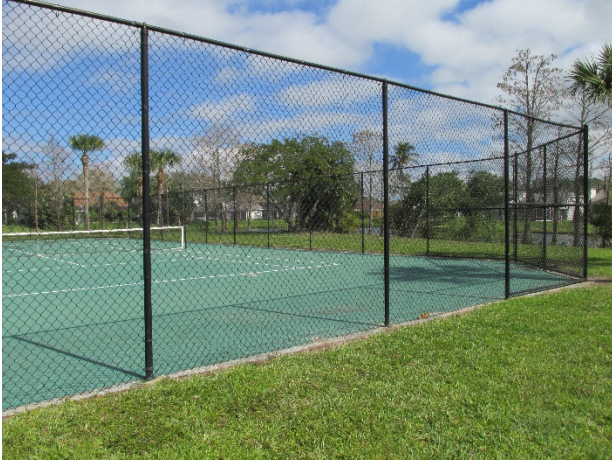
Tennis court fence