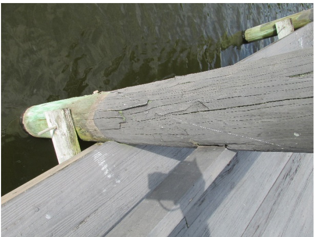
Wood piling deterioration evident