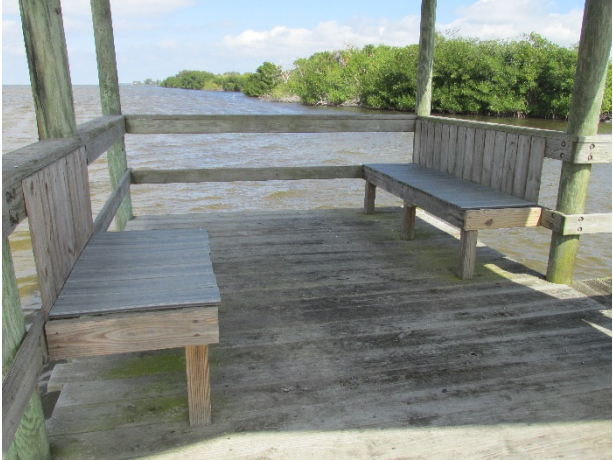
Sitting area under gazebo