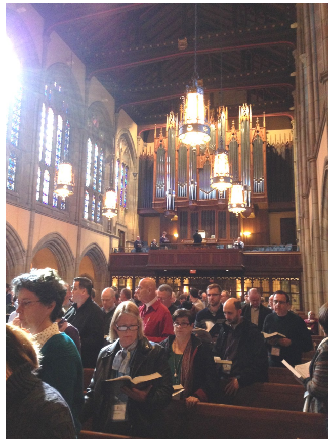
Church musicians gather for the annual January Jump Start, which will take place on January 28 in Bryn Mawr.

Deadline for articles, announcements, pictures and reports will be Wednesday, January 25.