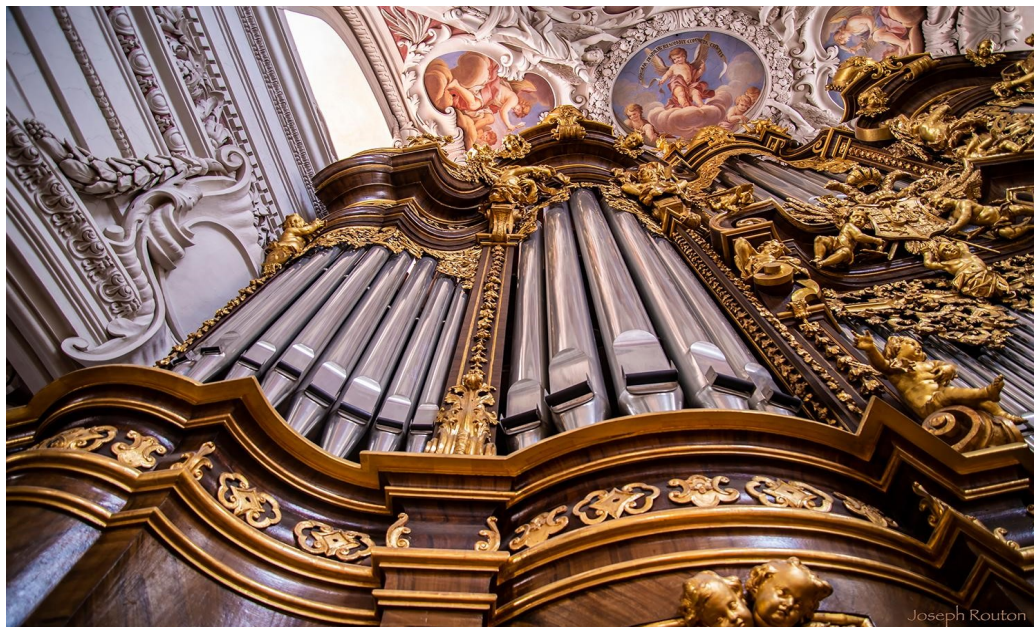
Largest Organ in Europe, St. Stephen's Cathedral, Passau, Germany