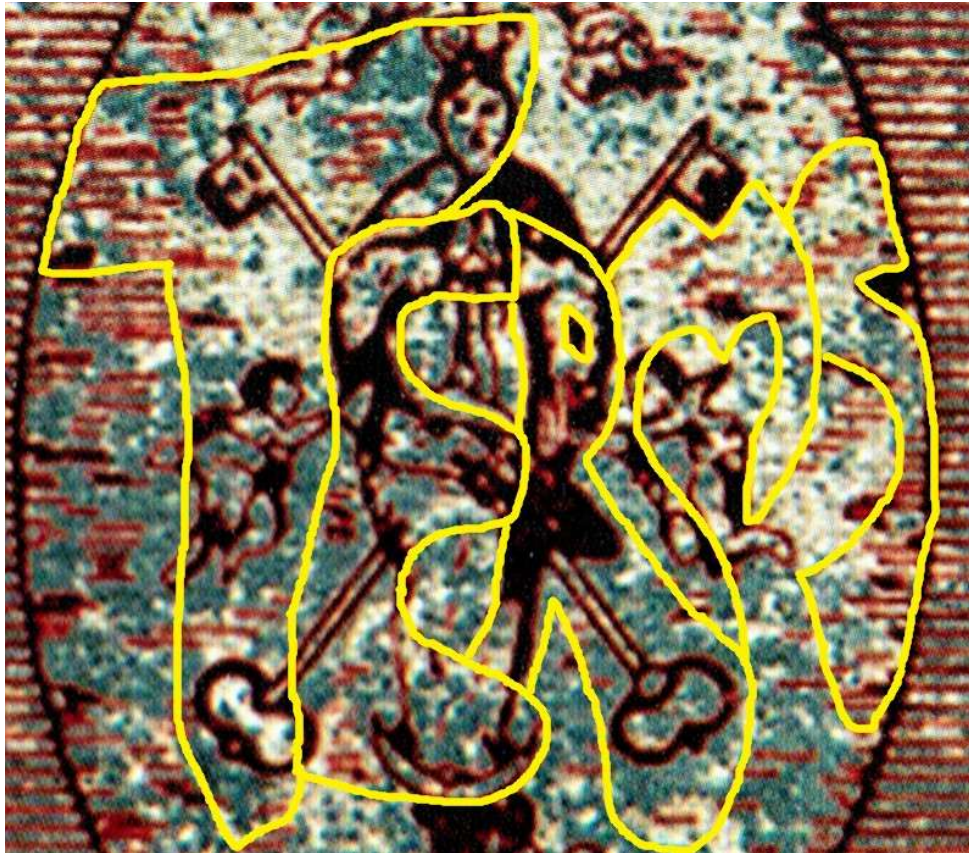
Above: A second expression of the word “Terms”, hidden in the central field of the Elder Badge.