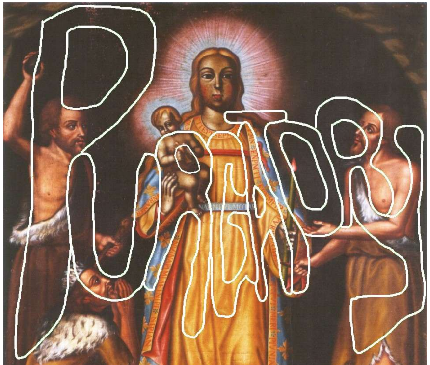
Above: A hidden image message in the Candelaria likeness, confirming that God and Jesus do use Purgatory. (For more, see The Candelaria Code )