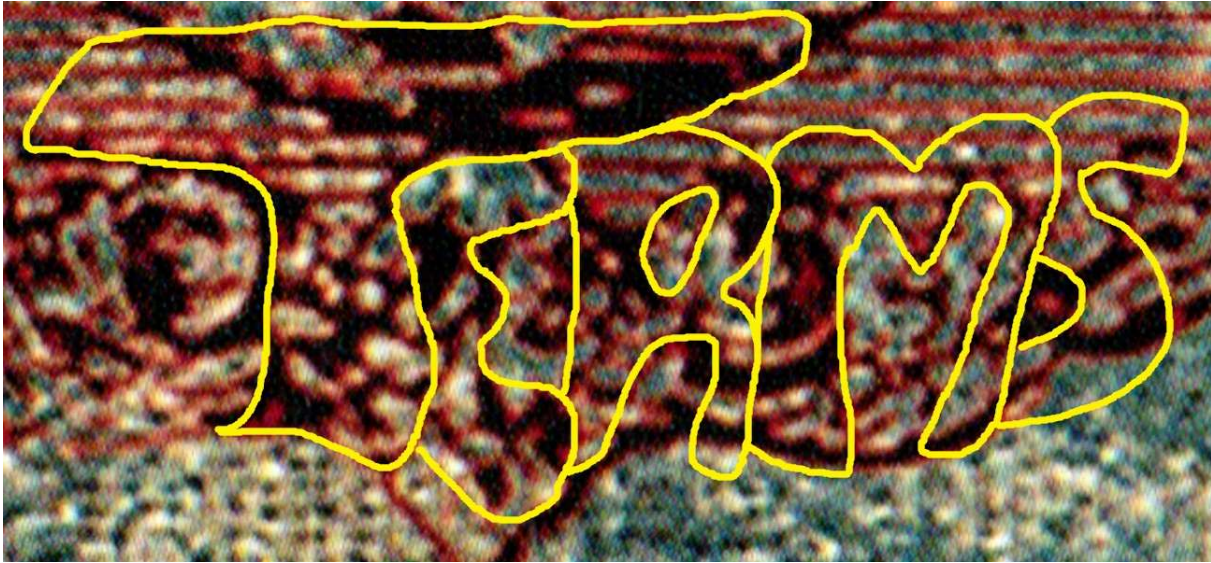
Above: The word "Terms", hidden in the Elder base's Unforgivable Crimes Timeline .

Based on the preceding, and what is fair, reasonable and just, my Wager Terms, which are non-negotiable ( except in the interests of justice ), follow: