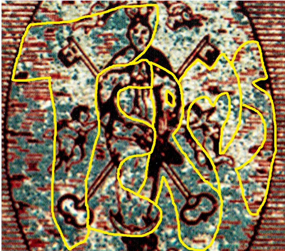
Above: A second expression of the word "Terms", hidden in the central field of the Elder Badge.