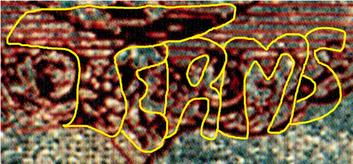
Above: The word "Terms", hidden in the Elder base's Unforgivable Crimes Timeline .

Based on the preceding, and what is fair, reasonable and just, my Wager Terms, which are non-negotiable ( except in the interests of justice ), follow: