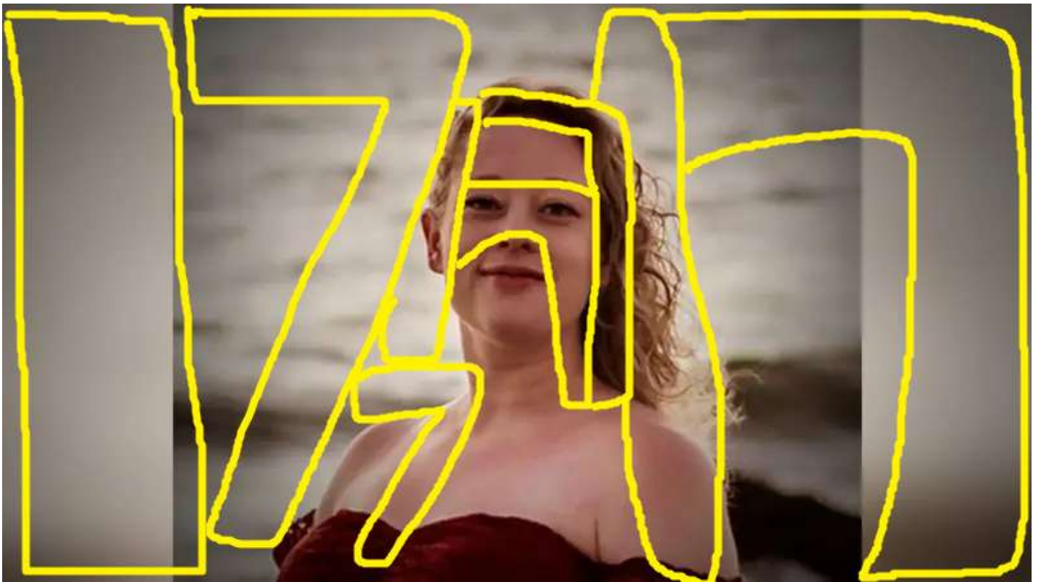
1 and 7 (January 7 th ) above; 26 (2026) below.