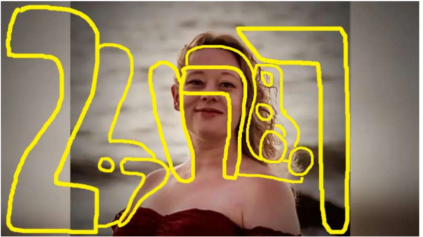
More expressions of 1/7/26, above and below.