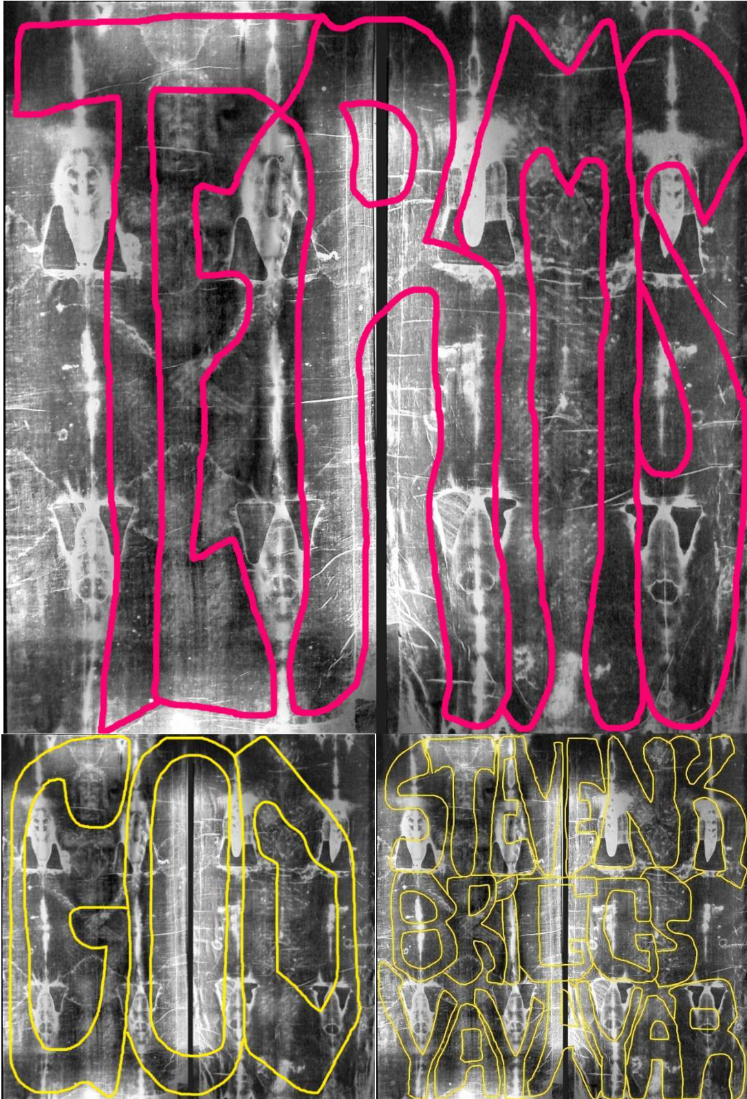
God confirmed my Terms in the Shroud of Turin , as seen in the outlining above, top. God signed the Shroud several ways, including with His name/title in the outlining above, lower left. He also included my name (right). See The Shroud of God , to see many more images –much larger.