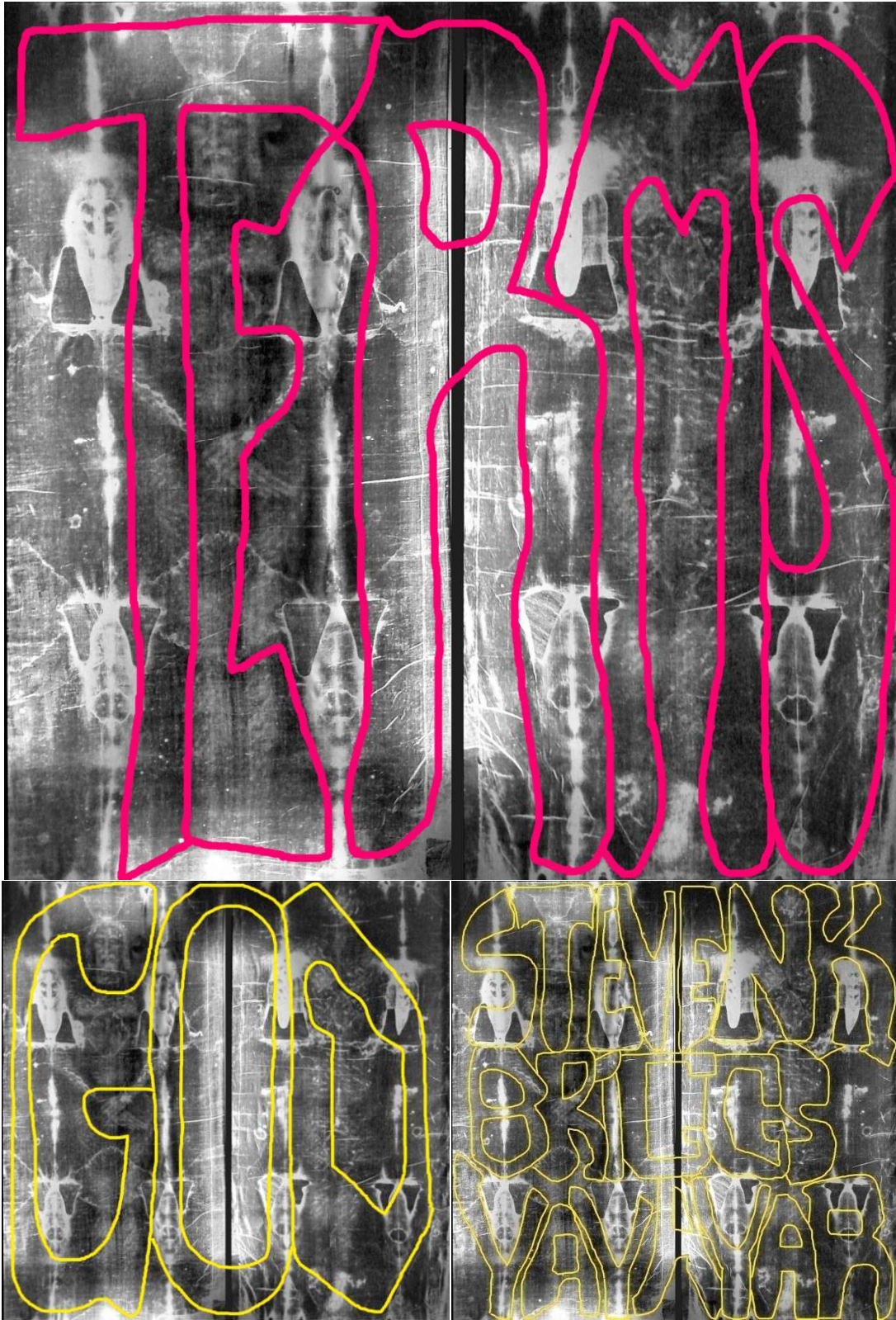
God confirmed my Terms in the Shroud of Turin , as seen in the outlining above, top. God signed the Shroud several ways, including with His name/title in the outlining above, lower left. He also included my name (right). See The Shroud of God , to see many more images –much larger.