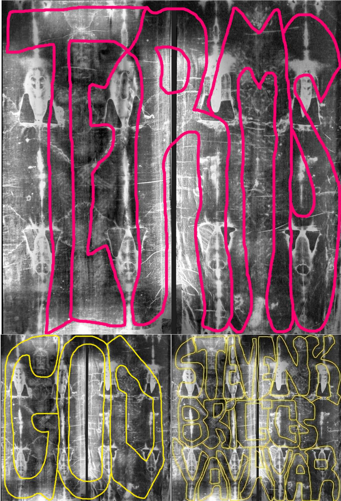
God confirmed my Terms in the Shroud of Turin , as seen in the outlining above, top. God signed the Shroud several ways, including with His name/title in the outlining above, lower left. He also included my name (right). See The Shroud of God , to see many more images –much larger.