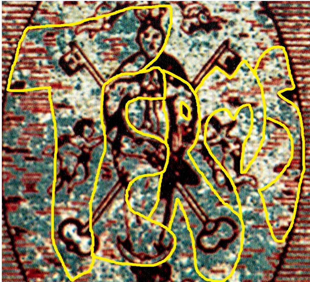
Left: A second expression of the word “Terms”, hidden in the central field of the Elder Badge.

All passages of these Terms, from the opening title, to the final word, and every bullet point in between, are enforceable aspects of these Terms.