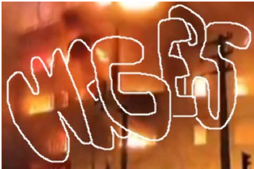
A word image from The United States is Dead .

“He’s reasonable... Now, as I was saying... On Christmas, Julian, the US falls and the final Major Wager ends. After that moment, any powers I give you come with some reasonable conditions. When you begin your long-shot effort to conceal the fall of US, I have some expectations... I’m going to need you to leave sufficient clues that your work, or much of it, are A.I. produced fakes. I will also need you to post the true One Hour War date in a fair number of places –of course, along with your deception date. And I’ll expect a few other confessions...”