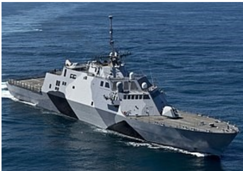
Freedom variant i.e. USS St. Louis (LCS-19)

are noted for their aluminum-hull trimaran design. They are built by Austal at its Mobile shipyard. The Freedom-class littoral combat ship variants have odd hull numbers and are constructed by Lockheed Martin at Fincantieri Marinette Marine shipyard in Wisconsin. The under-construction USS St. Louis (LCS-19) is a Freedom-class variant.