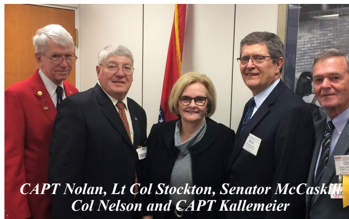
CAPT Nolan, Lt Col Stockton, Senator McCaskill, Col Nelson and CAPT Kallemeier

We thank the members of Congress from Missouri and/or their legislative directors for their support of our men and women in uniform who protect the nation. ROA's mission (support of a strong national defense) remains the same as when our organization was founded in 1922. We are truly blessed as a nation to have an all-volunteer active duty force and citizen-soldiers (Reserve Component consisting of Reserve and National Guard) who are ready and willing to defend our freedoms. I encourage other ROA leaders and members to plan to join us next March as we will again visit our members of Congress from Missouri to talk about important issues which affect the readiness of our forces.