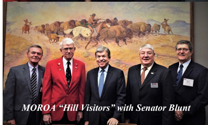
MOROA "Hill Visitors" with Senator Blunt