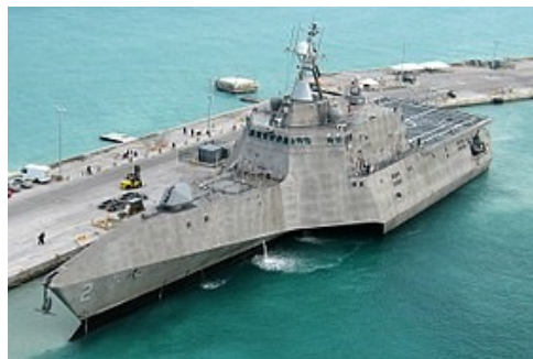
Independence variant i.e. USS Manchester (LCS-14)

The Independence-class is one of two littoral combat ship variants. The Independence-class variant, signified with even-numbered hulls,