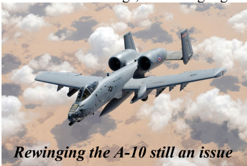
Rewing the A-10 still an issue

on to get those built quickly and installed before any more aircraft are retired. If you have not yet read the new Reserve Voice, it contains a good article