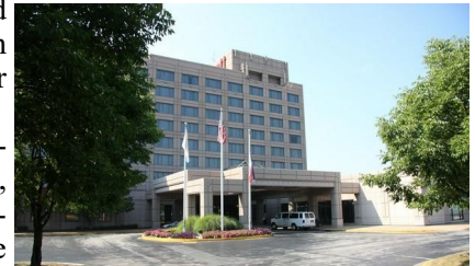
St. Louis Marriott-West

At our annual convention in April 2019, the Executive Committee agreed to hold the 2020 State Convention in the St. Louis area.