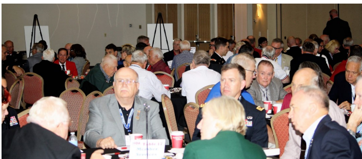
Facilitated Round Table discussions regarding ways to improve ROA services to the membership

Saturday morning's general session reviewed the roundtable discussions and heard Dr. Joseph Heck , Chair-