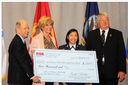
Eileen Bonner Scholarship presentation

The 2019 ROA National Convention opened on 26 September at the Des Moines Marriott Downtown. The day was filled with committee meetings and the ROA Academy. The Academy prepares members for Chapter and Department leadership positions and updates current leaders with recent organizational changes. At this session the students learned about the new website to be online later this year. In the evening a welcome reception was held at the Des Moines Veterans Hall of Honor.