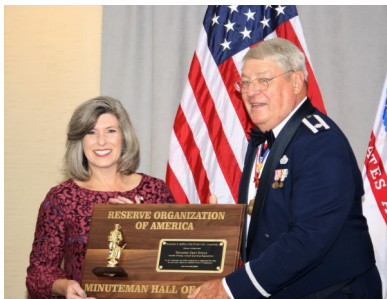
Senator Joni Ernst ROA Minuteman of the Year Recipient