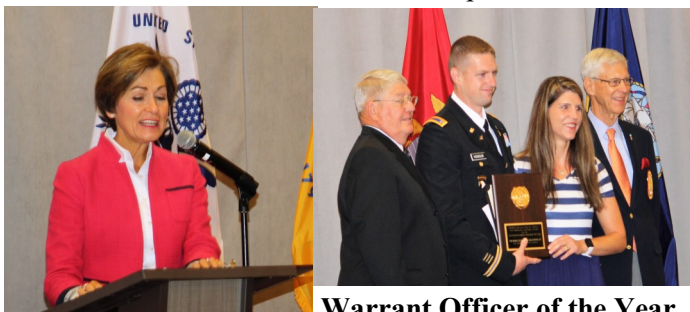
Warrant Officer of the Year