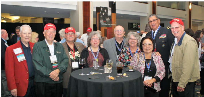
Members gather at the Welcoming Reception