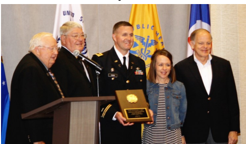
Chaplain of the Year