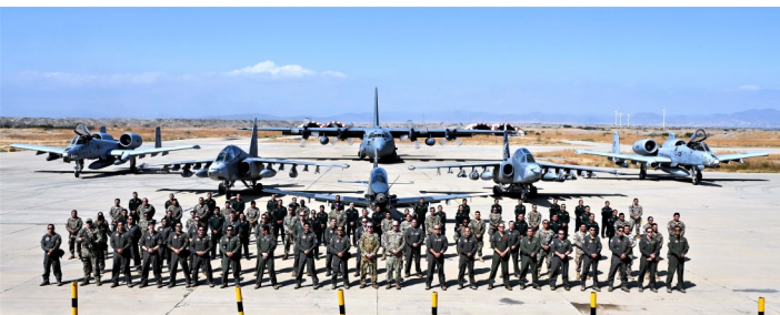
64th AEW Chiclayo Air Base, Peru

Airmen from the 442d Fighter Wing recently returned from Peru in the first-ever entirely Air Force Reserve air expeditionary wing (AEW). Operating from three separate locations and working closely with host-nation personnel, the 64th AEW set up shop and launched Patriot Fury – a sub-exercise within the larger joint-force, international exercise Resolute Sentinel '23. Settling in primarily at Chiclayo Air Base in Peru, the 64th operated for over a month with a variety of US aircraft including C-17s, C-130s and A-10s. In addition to facilities at Chiclayo, specialized exercises and support operations were completed at locations in Lima and El Pato Air Base. The A-10s did what A-10s do – close air support and combat search and rescue – but this time, the scenery and other aircraft involved were definitely not ordinary. Peruvian pilots involved in the exercises were flying Russian SU-25 and South Korean KT-1 attack aircraft.