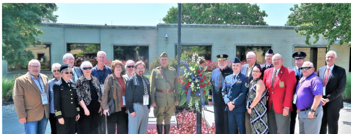
Conventioners honor President Truman at wreath presentation

Breaking News, The Excom has announced the 2024 MOROA Convention will be at the Inn at Grand Glaize, Osage Beach, Missouri, 26-28 April 2024.