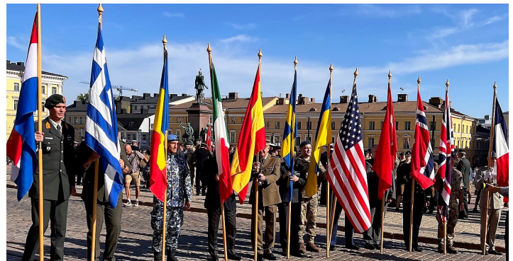
CIOR opening ceremony in Helsinki

tions. The 2023 CIOR was held in Helsinki, Finland. The forthcoming 2024 CIOR will be held in Estonia, and MOROA intends to send another larger delegation to Tallinn, Estonia.