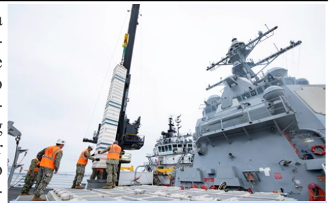
Sailors aboard the USS Spruance (DDG 111) guide training ordnance into the ship's forward vertical launch system (VLS) cells during a proof-of-concept evolution in San Diego. MV Ocean Valor conducted its first at-sea vertical launch system reload with Spruance, demonstrating the ability to re-arm surface vessels who employ VLS.

Three US military services without Senate-confirmed chiefs for first time in history... Another US military service chief has relinquished command without a Senate-confirmed replacement in place, marking the first time in the Defense Department's history that three services are operating without a confirmed senior military officer in place. Chief of Naval Operations ADM Mike Gilday relinquished command on Monday. His nominated replacement, ADM Lisa Franchetti , is one of more than 300 military officers whose promotions are being stalled by Republican Senator Tommy Tuberville , in protest of Pentagon reproductive health policies. Franchetti will serve as the acting Chief of Naval Operations in the absence of her Senate confir-