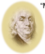
"MOROA Transmitter" Recipient of ROA's Benjamin Franklin Journalism Award and Sword & Pen Award