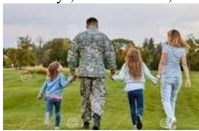
The Reservist balancing family, work and military

As local units began to schedule annual training exercises, often conducted in California, New Jersey, Indiana, and Virginia; significant bus transportation on the arrival side caused delays, to add to this, the price of the bus transportation in 2022 year nearly doubled from previous years. Buses are used to transport Soldiers from airport of arrival to training areas and back.