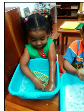
Care of Environment: Washing Dishes