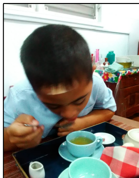
Care of Self: Tea Preparation