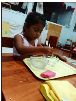
Preliminary Exercise: Spooning