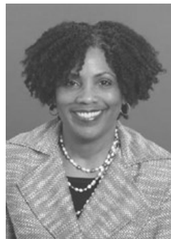
Roxanne Norman Council