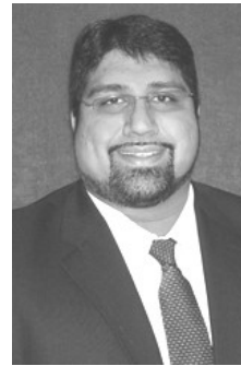
Yusef Sayeed Council