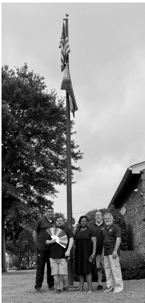
Left Photo: The raising of the Pride Flag to honor Aldan's LGBTQ community during Pride Month.