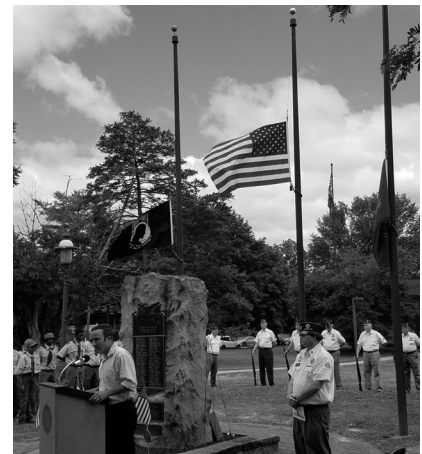
May 31, 2021: Memorial Day Ceremony held by Aldan American Legion Post 1000 and Aldan Borough to pay tribute to the men and women who gave their lives for our country.