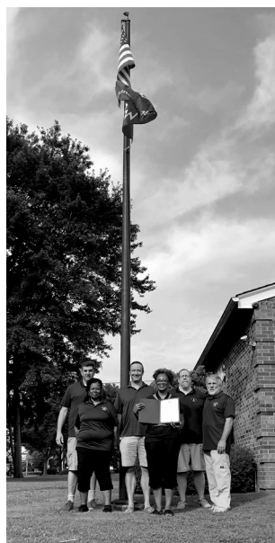
Right Photo: The raising of the Juneteenth Flag on June 19th to celebrate the emancipation of slaves.