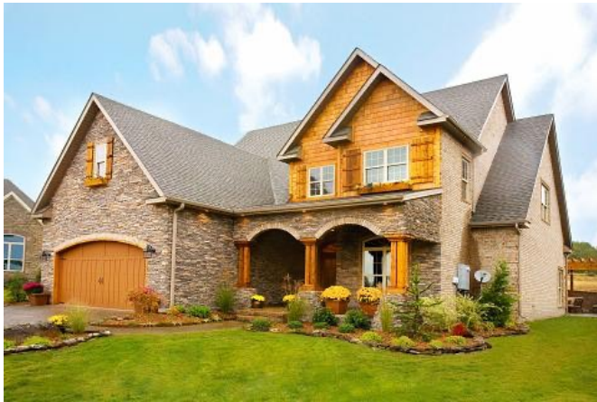
Exhibit B: Appropriate Stone's Lake Home Style Designs