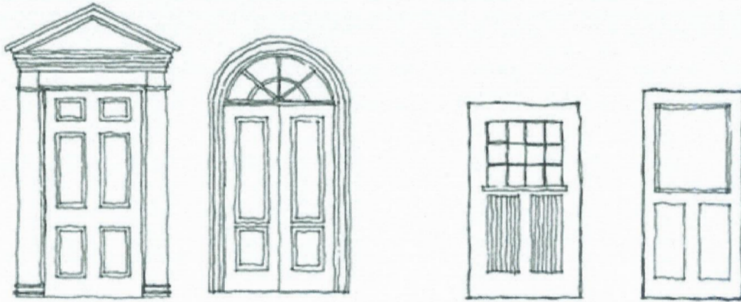
Exhibit A: Appropriate Stone's Lake Window and Door Designs