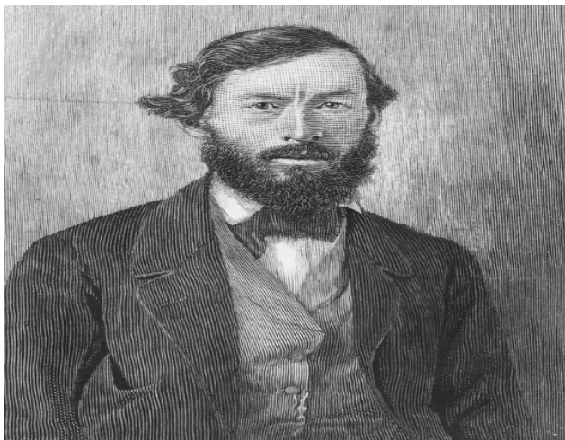
Commander John Taylor Wood, CSN.