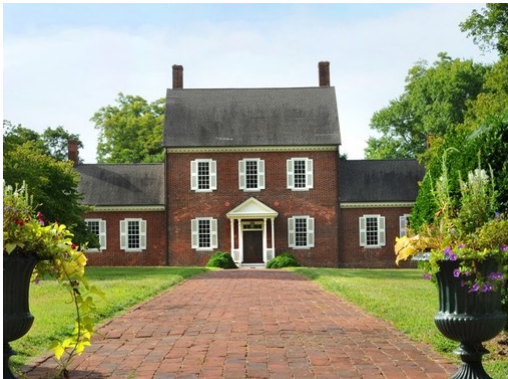
The Kirkland Home, Ayr Mount, Hillsborough, North Carolina