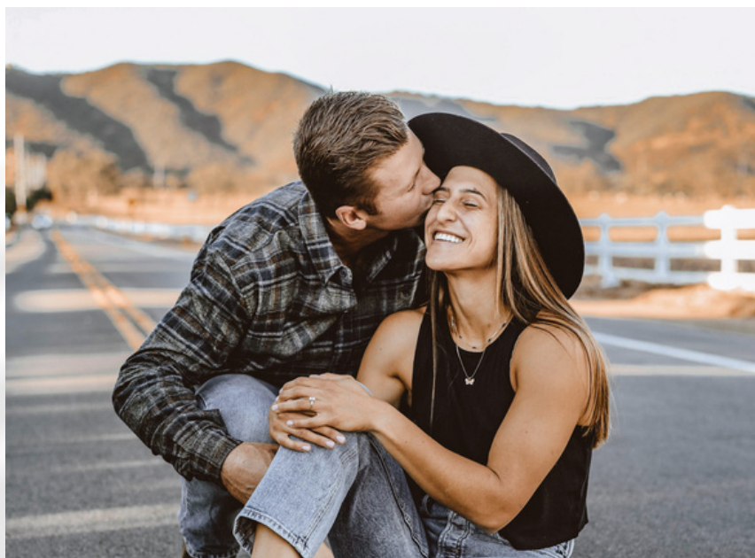
Potrero Road in Thousand Oaks, CA