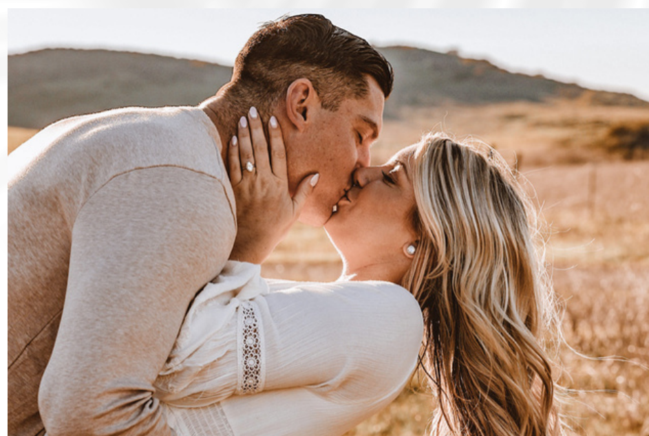
Wendy Potrero Trailhead in Newbury Park, CA