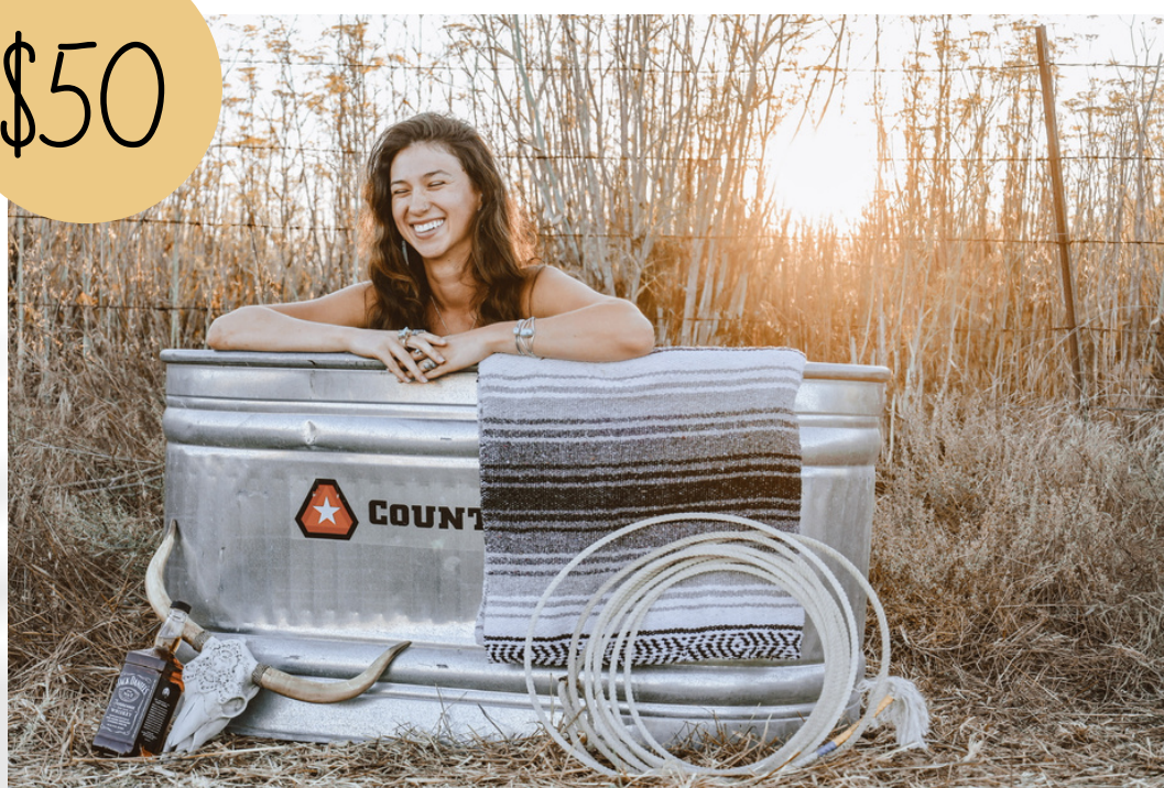
Beth Dutton Set