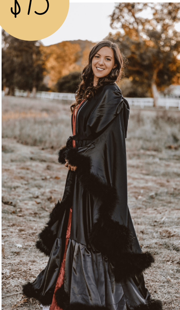
Black Feather Robe Women's OSFA