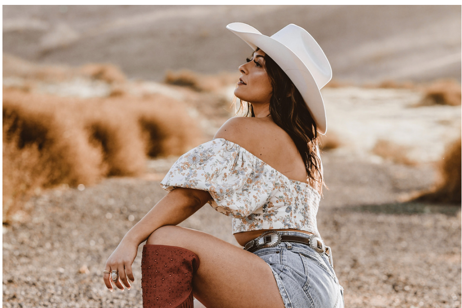
Private Horse Ranch in Moorpark, CA