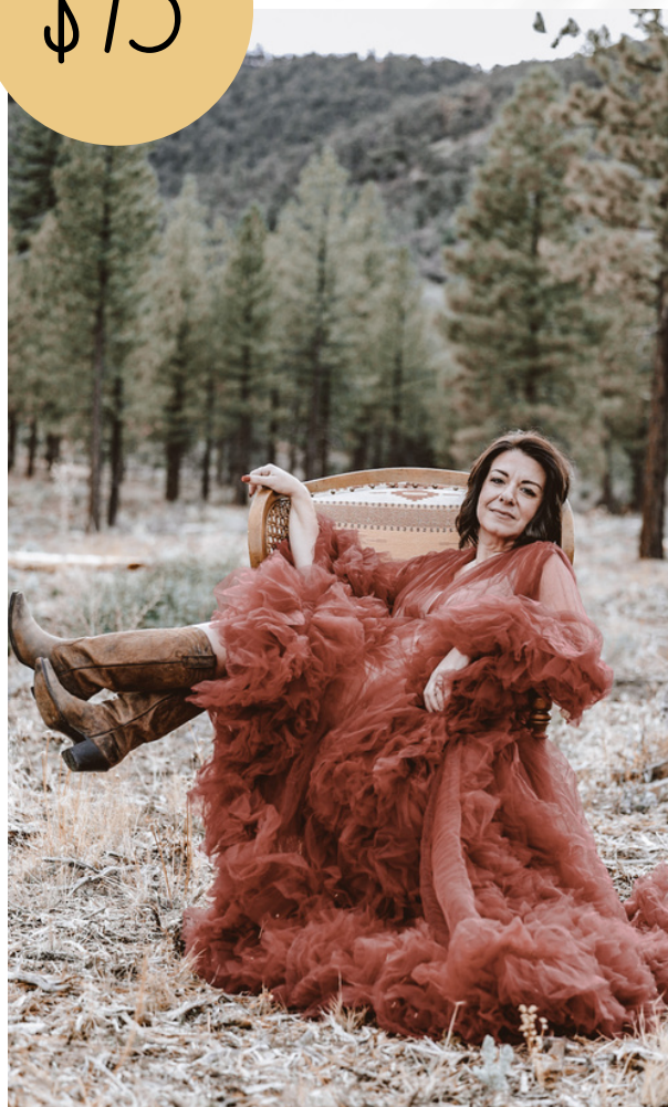
Burgundy Tulle Robe Women's OSFA