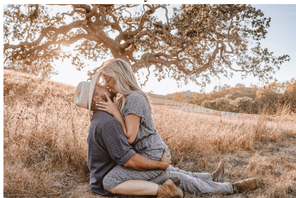
Big Sycamore Canyon Road in Newbury Park, CA