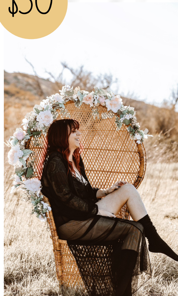
Wicket Floral Peacock Chair