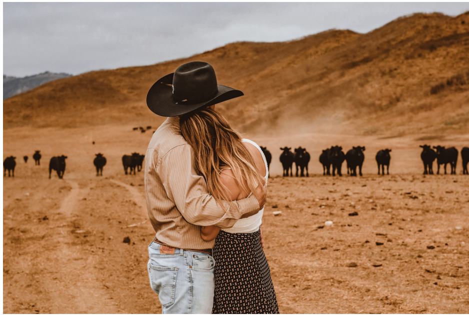
Private Cattle Ranch in Santa Paula, CA