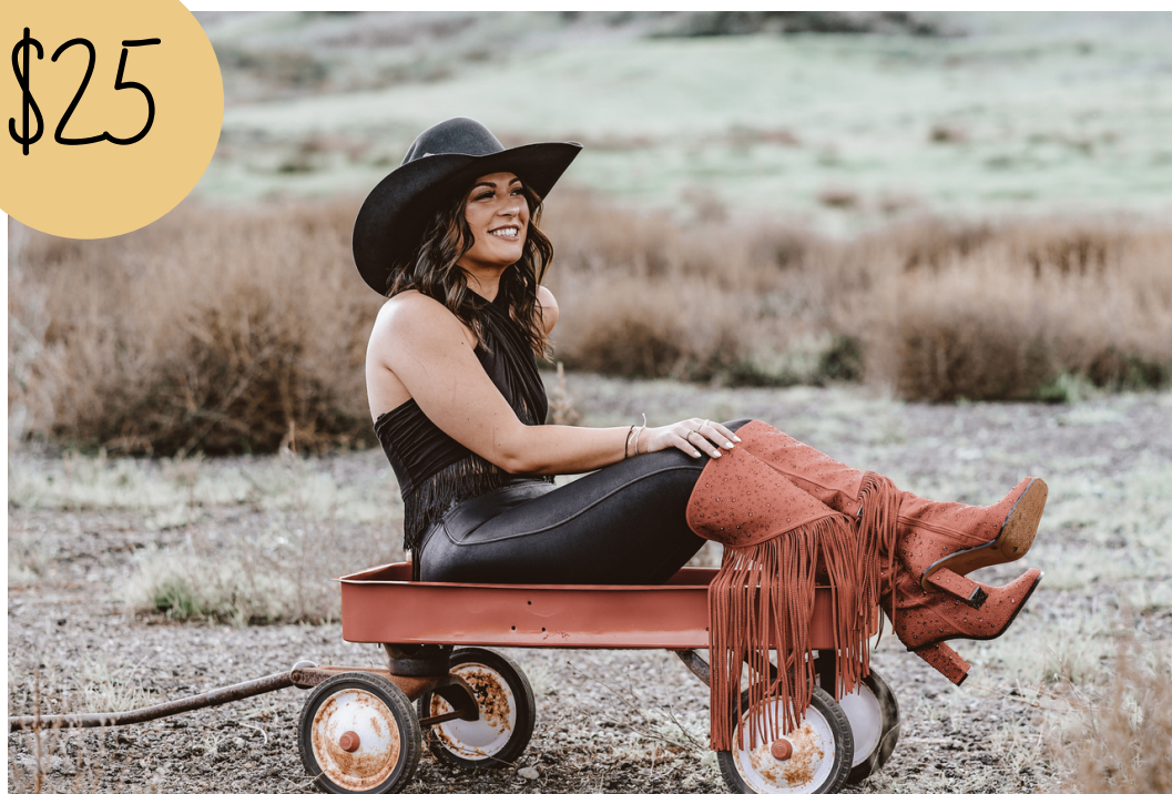
Little Red Wagon