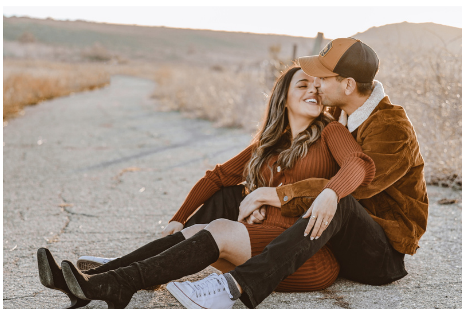
Arroyo Conejo Paved Trail in Newbury Park, CA