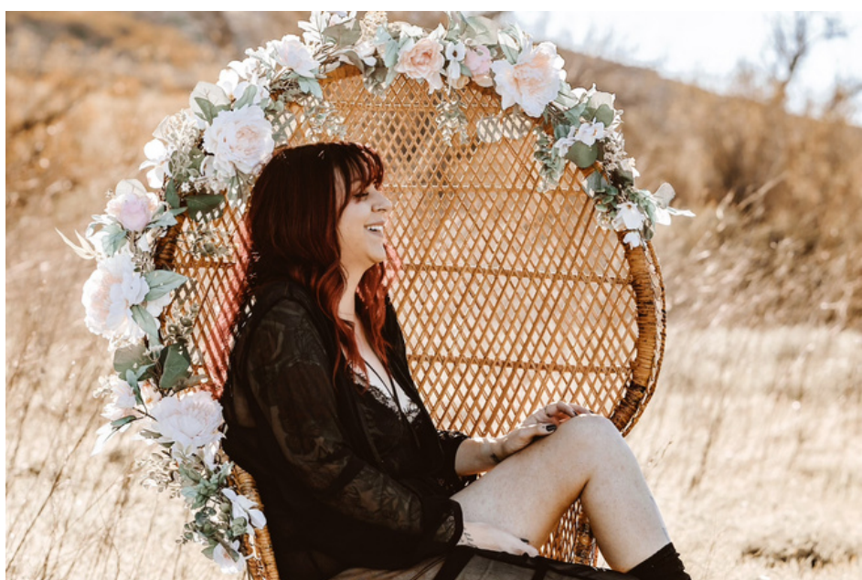
Rancho Potrero Trailhead in Newbury Park, CA

Examples of some of my common locations!