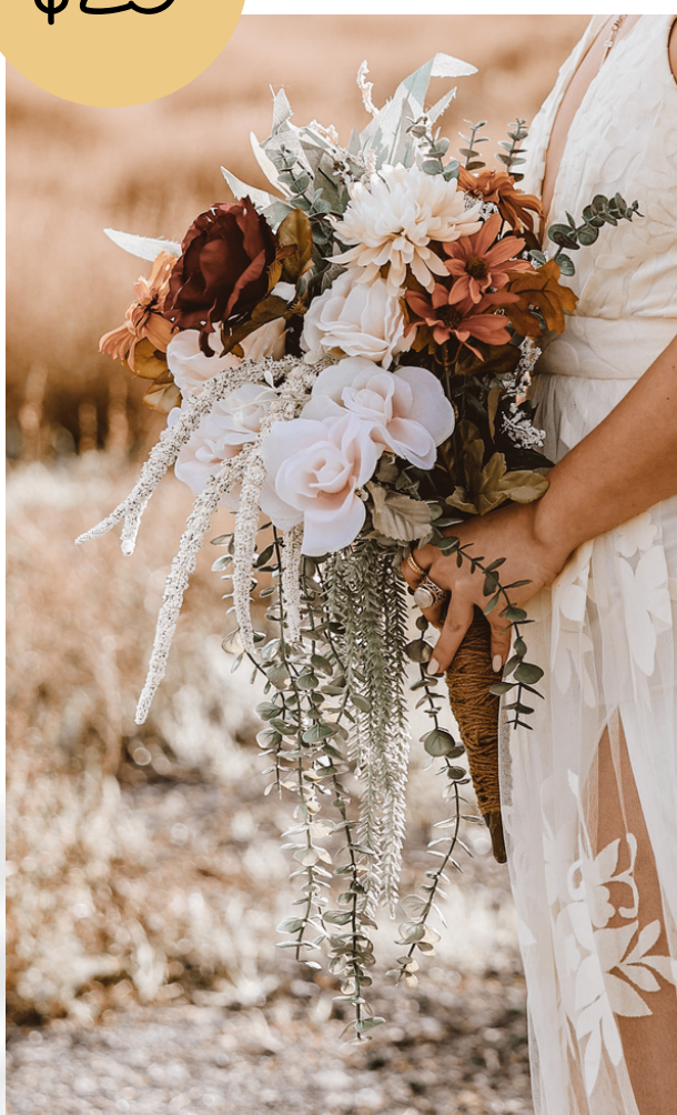
Faux Floral Arrangement Boquet