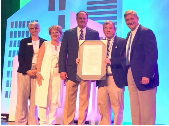
Swainsboro/Emanuel Co. - Silver Award Winner