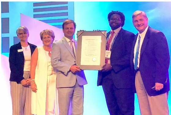
Athens-Clarke County GPP Platinum Award