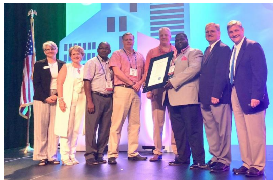
Douglas/Coffee County Gold Award Winner

Contact us if your business or community would like to support the Leadership Adventure Weekend.