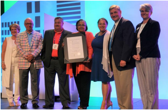
City of Valdosta - Bronze Award Winner