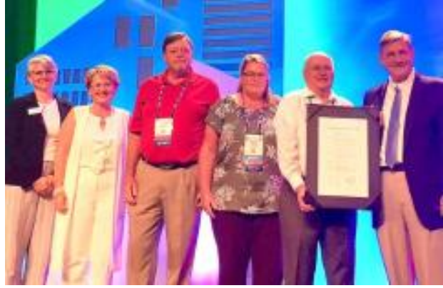
Blairsville/Union Co. - Bronze Award Winner