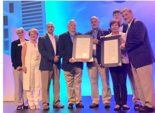
Vidalia & Lyons/Toombs Co. - Bronze Award Winner