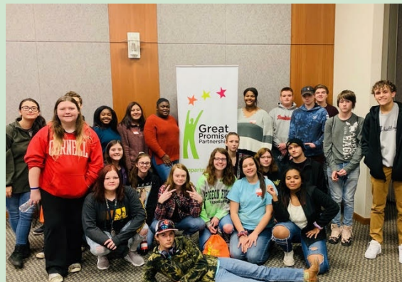
Students from Chattooga County High School are joined by others from