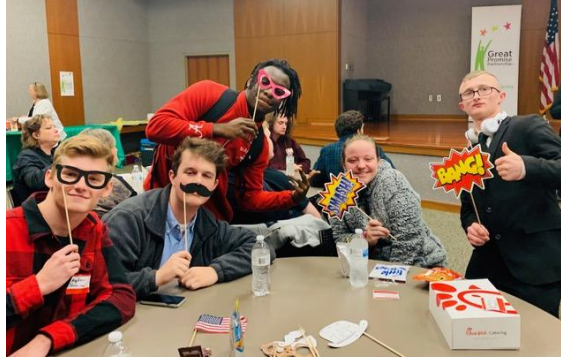
Students have fun during lunch at the Northwest Georgia REAL Skills Day in January