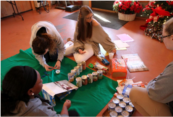
(Left) GPP students from Emanuel County work together to design a mini golf course with donated food. Mentors tested their designs in the judging phase of the competition!

GPP is proud to recognize mentors from around the state. To become a mentor, contact a GPP Regional Coordinator, listed at the end of this newsletter.