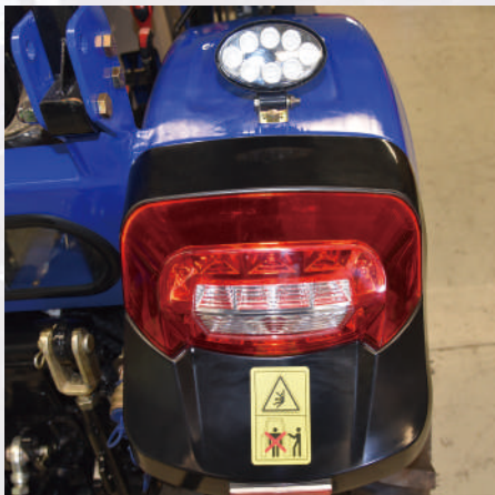
Full LED lighting