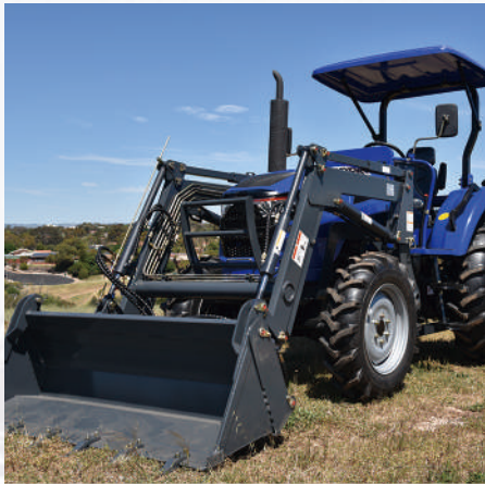
Quick hitch self-levelling front end Loader with 4in1 Bucket (Optional Joystick)