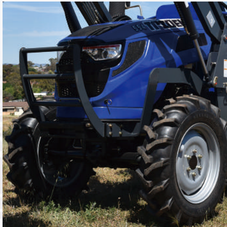
Bull Bar - Gives extra protection on FEL loader work