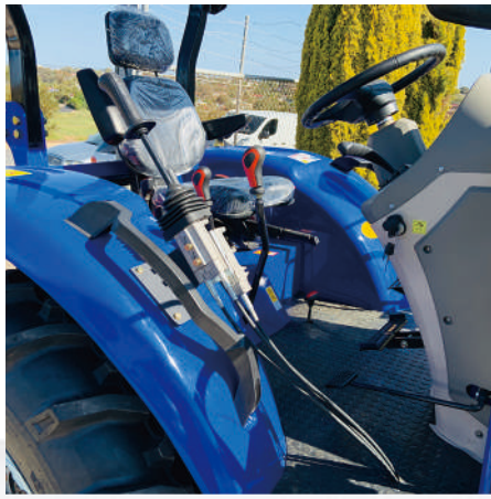
Flat clear deck & air suspension seat for comfortable drive