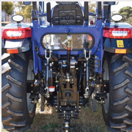
Hydraulic up & down 3-point linkage