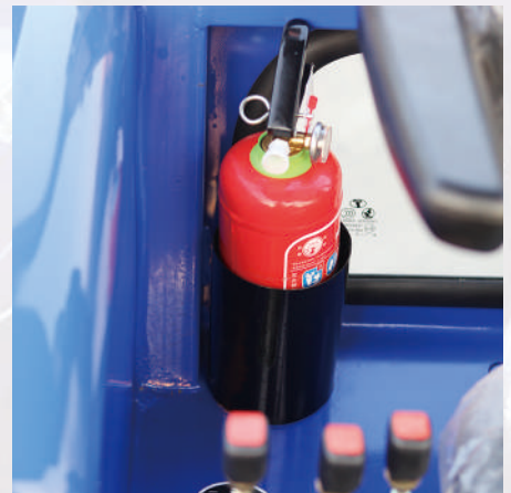
Additional dry powder fire extinguisher