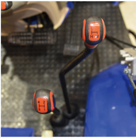
12F+12R side placed gear shift