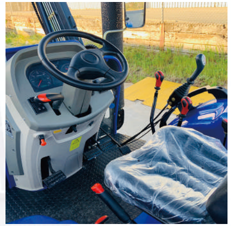
Shuttle shift & adjustable steering wheel