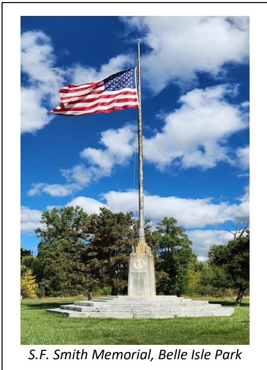
S.F. Smith Memorial, Belle Isle Park

Samuel Francis Smith (1808-1895), American Baptist minister, journalist, professor, and author is best known for having written "America (My Country, 'Tis of Thee)".