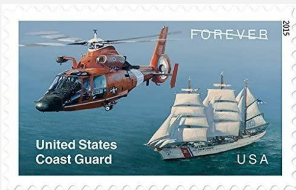
U.S. Scott #5008

The United States Coast Guard traces its founding to an act of Congress on August 4, 1790. At that time, the Coast Guard consisted of ten vessels that carried out enforcement of various trade and humanitarian duties. National Coast Guard Day on August 4th celebrates and honors the courageous work of service members of the Coast Guard: “Semper Paratus” – Always Ready.