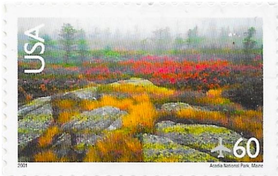
Scott #C138 (Acadia National Park)

From mighty canyons and snow-capped volcanoes to redwood forests and salt-sprayed beaches, we celebrate our sixty-three National Parks during the month of August.