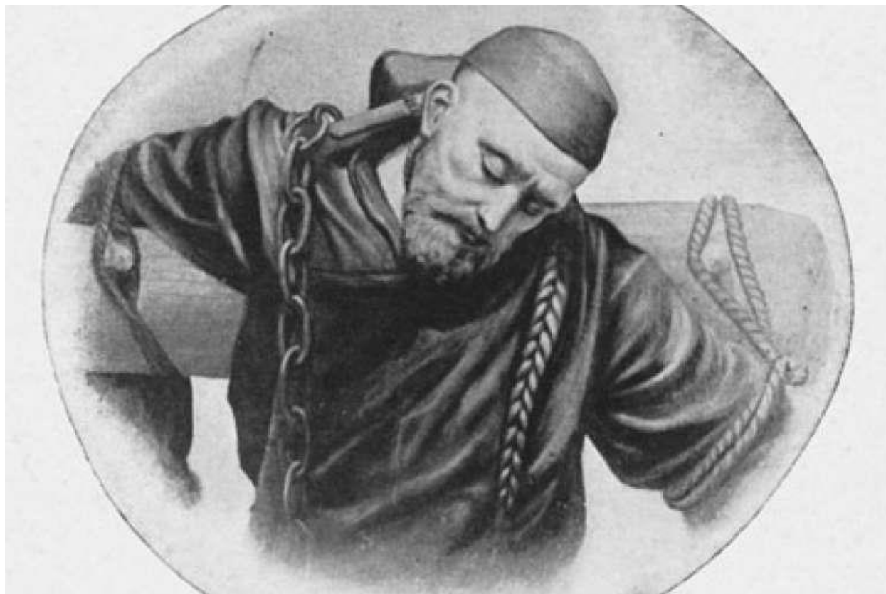
An image of St. Jean-Gabriel Perboyre from Wuhan, China