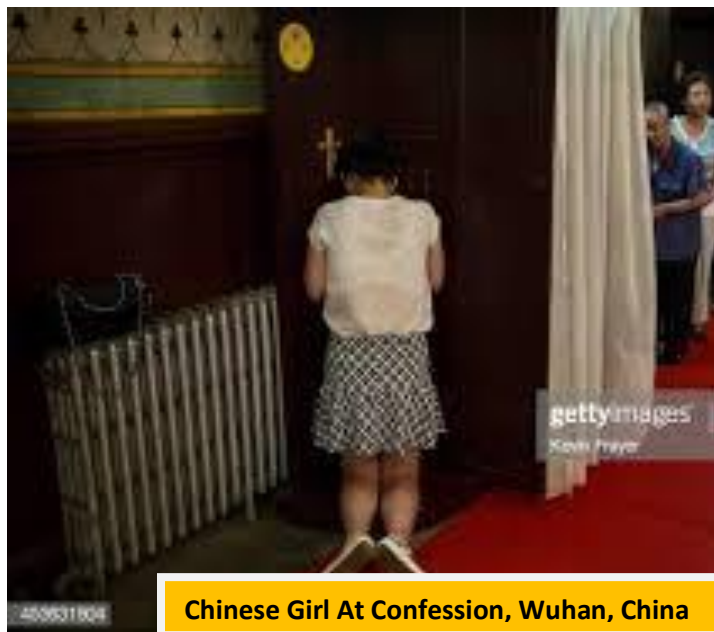
Chinese Girl At Confession, Wuhan, China