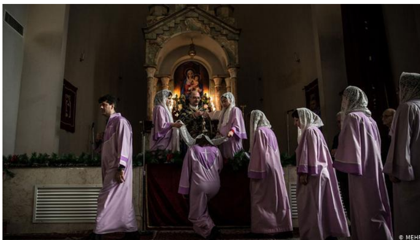
Christians in Iran hold a New Year's service