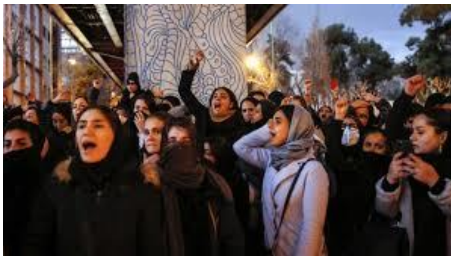
Women protesting in Iran over abuse of women

"Iran is a totalitarian state, a surveillance state, and a police state that tries to protect the population from anything outside of the Shiite or Islamic culture," according to katholisch.de , the website of the Catholic Church in Germany.