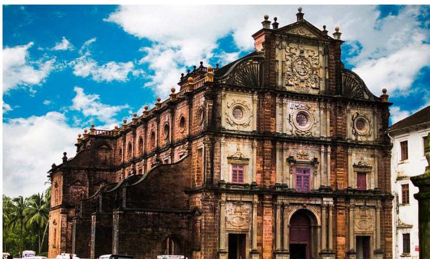
Basilica of Bom Jesus, Goa

The history of Christianity and Churches date back to 52 AD in India. It is believed that St. Thomas, one of the apostles of Jesus visited the country and thus introduced a new faith in South India. St. Thomas himself established one or two Church in Kerala but he inspired many to construct these Christian places of worship across the country. Colonization was a significant era of building churches as the Dutch, Portuguese, French and British people brought with them new styles of architecture, which resulted in delivering India with exquisite churches that are a must see in India.