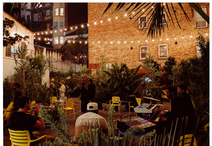
Opening night event of Cosmo Court Pop-Up with live music performed by the Magic School Bus.