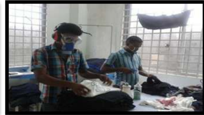
Spot remove room