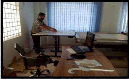
Digital Pattern cutter MC

The sample making section is headed by an experienced sample room in charge. We provided full range of machinery and skilled technician to handle full cycle of sample development by our own sample room. We guarantee all photo samples, fitting samples, salesman samples for all collections and seasons are produced under this section that can be aligned with customers need from sample development up to delivery in an optimistic outcome. Pattern grading, marker and converter, digitizer, high speed inkjet plotter, pattern cutter,