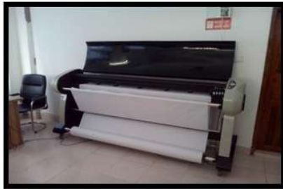
High speed inkjet plotter