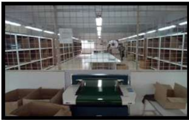
Metal free zone