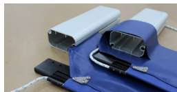
Rope or loop leading edges.