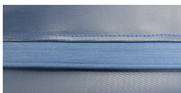
Color-matched heat-sealed webbing sewn on. No additional charge.