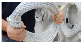
Upgraded Premium rope to eliminate stretching as standard on all covers. No additional charge.