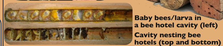
Baby bees/larva in a bee hotel cavity (left) Cavity nesting bee hotels (top and bottom)