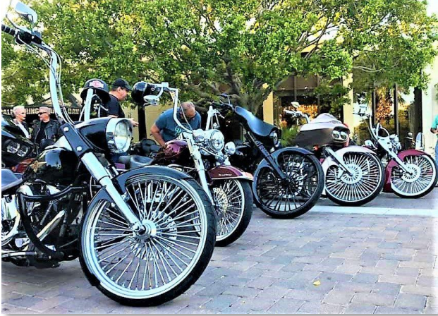
Big wheels were a big hit