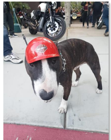
Even the dogs came out for Bike Night!