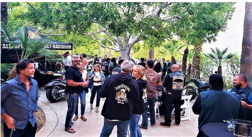
High winds? Who cares? You can't keep these bikers away!