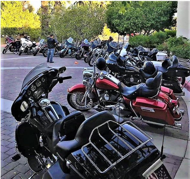
Bikes of all shapes and sizes were on show