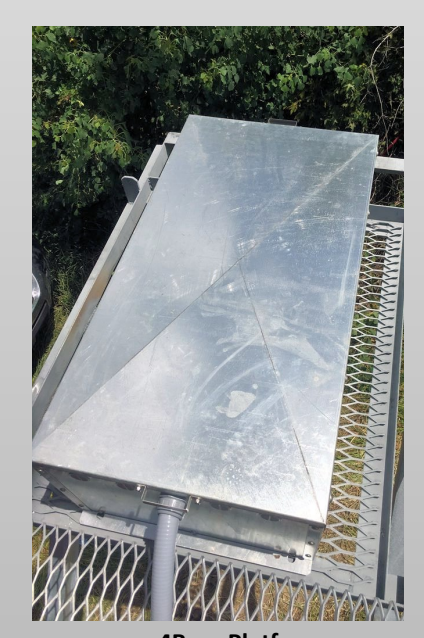
4B on Platform

Kevin Conlin 844.909.9095 kconlin@autonomouspwr.com Autonomouspwr.com