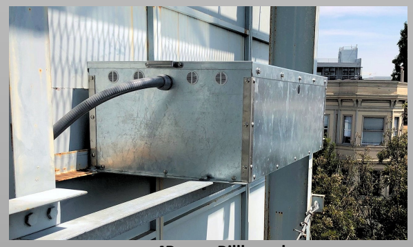
4B on a Billboard