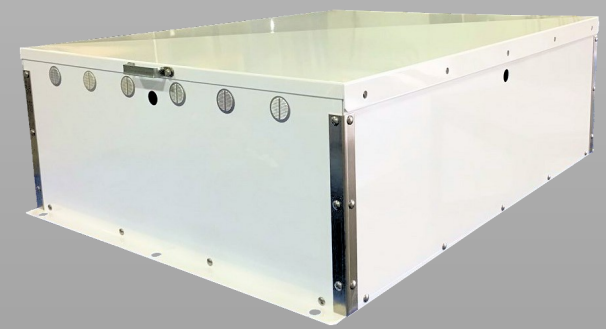
Powder Coated Aluminum for Coastal Locations