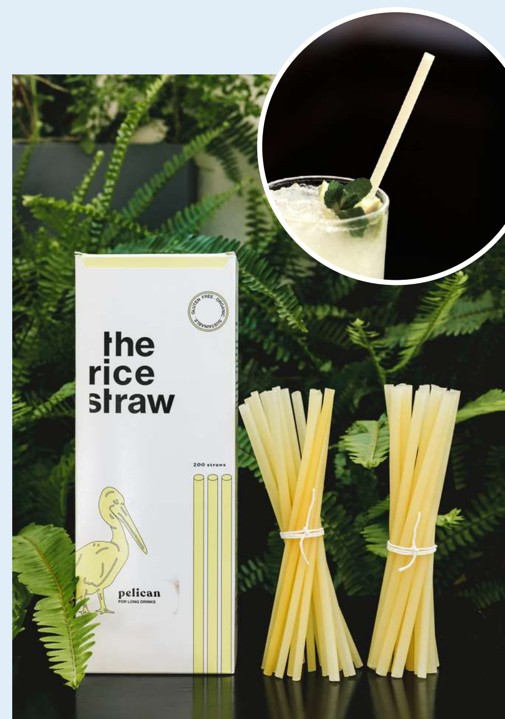
pelican WHITE STRAWS LONG DRINK | SMOOTHIE