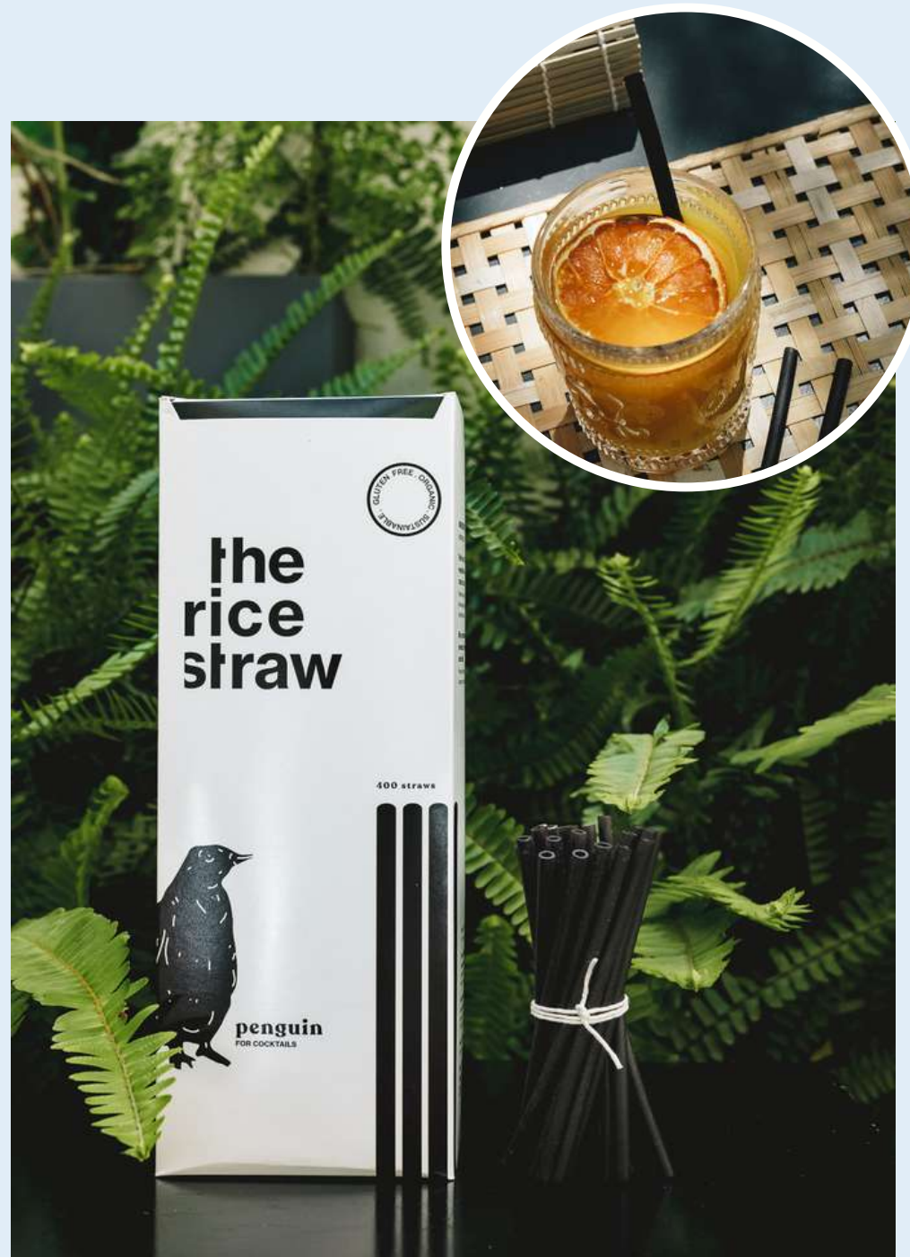
penguin BLACK STRAWS COCKTAIL