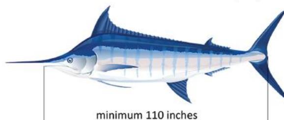
BLUE MARLIN LOWER JAW FORK LENGTH (LJFL)