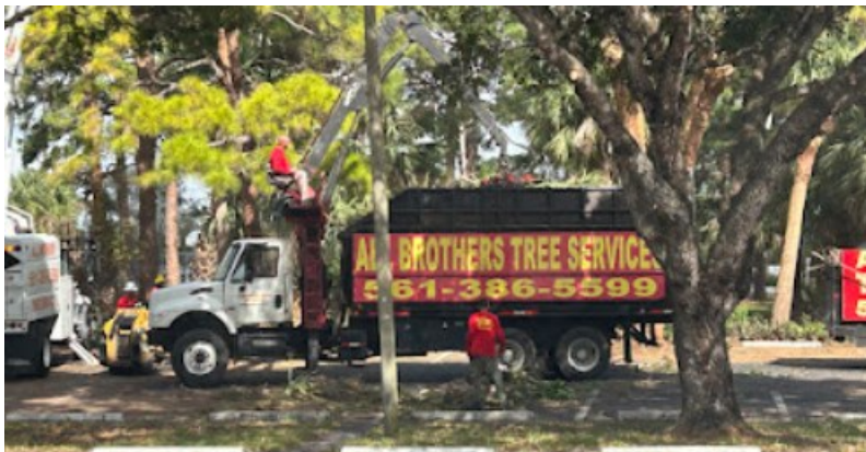
Tree trimming at Nativity