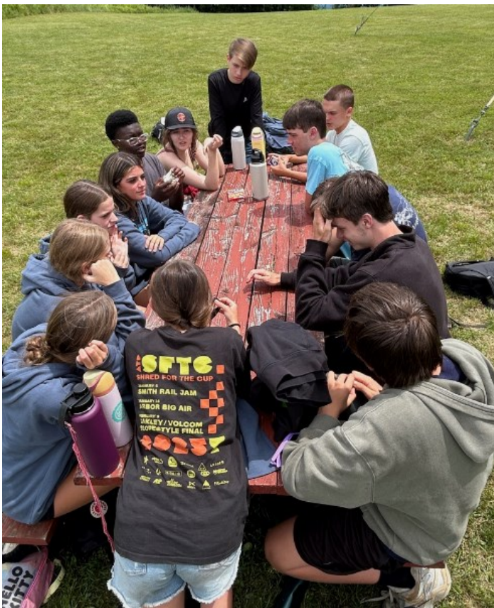
Kids playing cards, telling stories as they wait their turn to climb Skypark