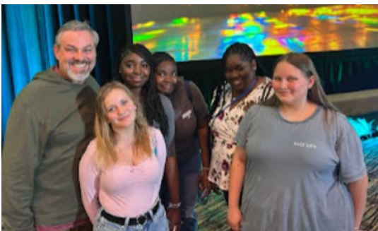
Nativity Youth in Synod Assembly group photo.