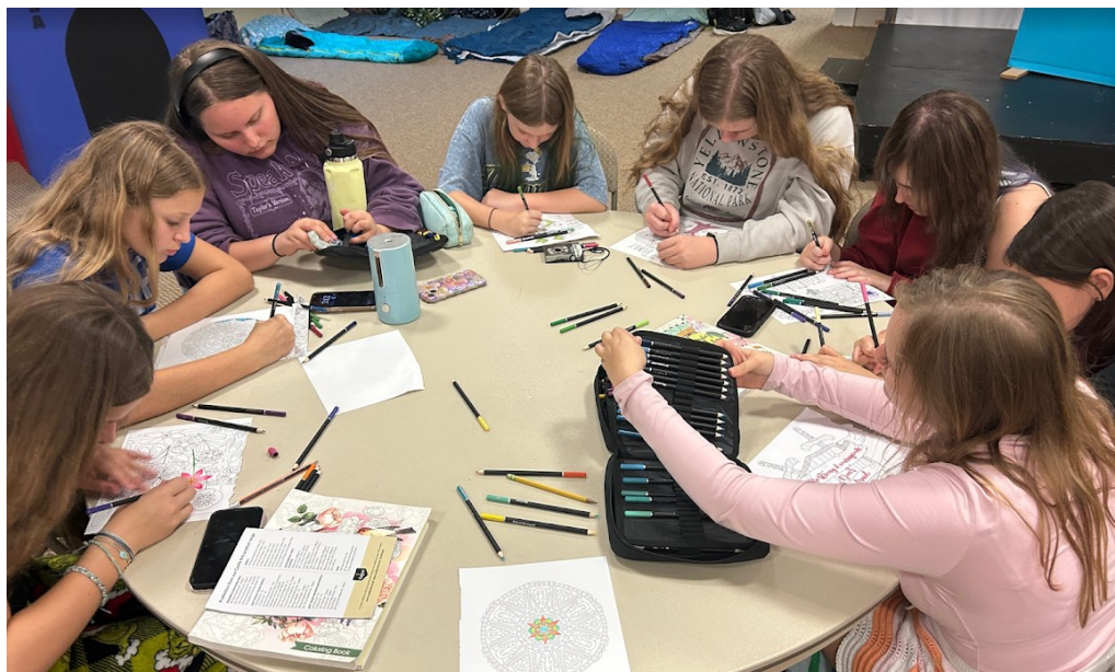
Quiet evening of coloring at our overnight traveling stay, Messiah Lutheran in Savannah, GA.