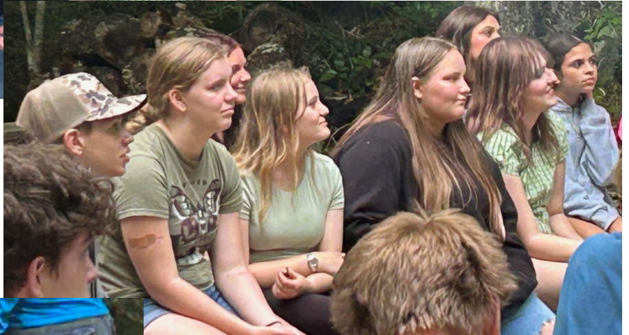
Enjoying campfire worship.