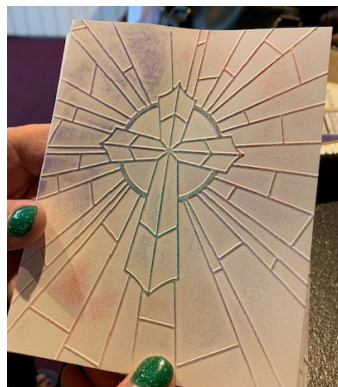
Shown here is a sample of a notecard that can be used for words of encouragement to be shared by Nativity with recipients of services from the Project.