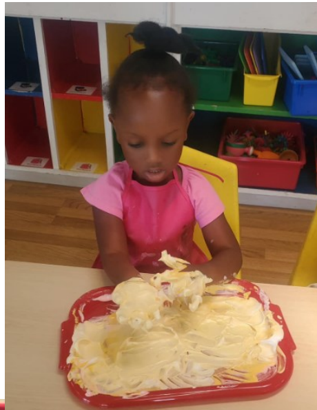
Messy fun Imagination Station Making Moon Sand