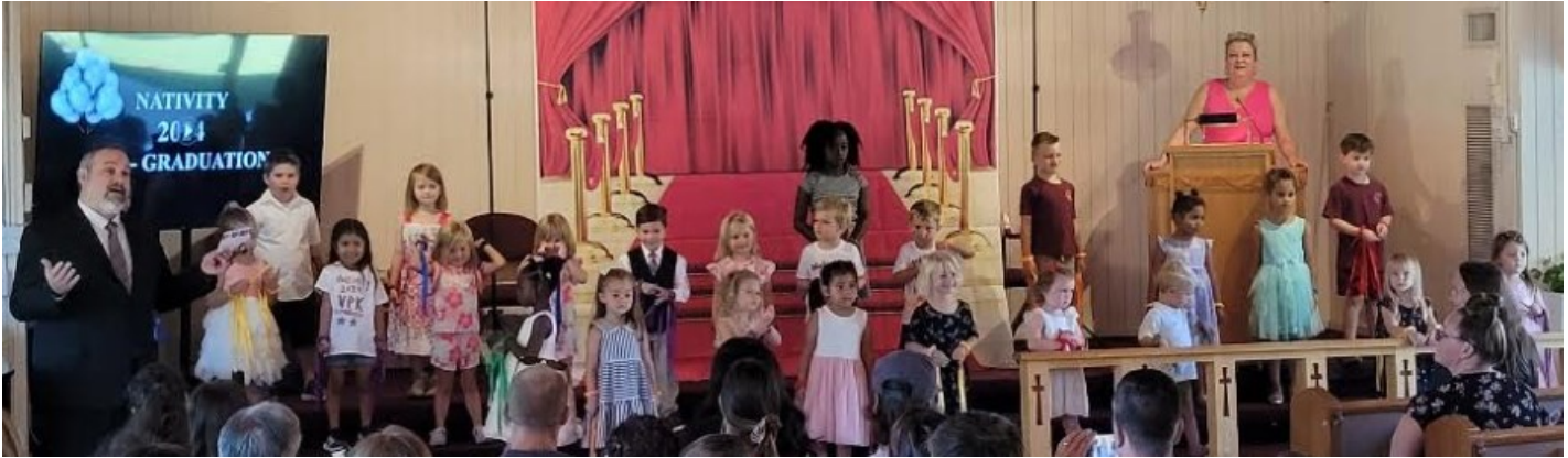
The entire school above. Our largest graduation class below, 17 graduates. And the 2s and 3s on next photo.

Wednesday, May 29, Nativity Preschool had 150 people in attendance for the graduation and end of year ceremony. It was a wonderful event.