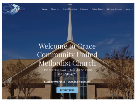
Check out our website for church happenings, activities, small groups, signups and general information.